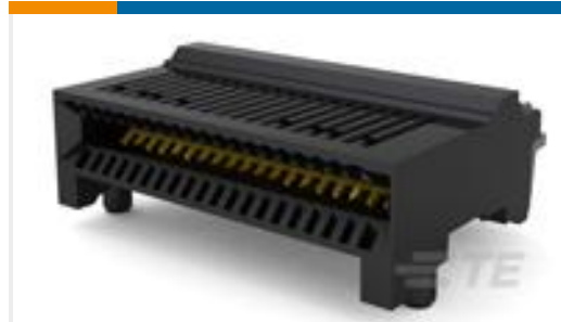
TE Part #1551920-2 zQSFP+ connector assembly