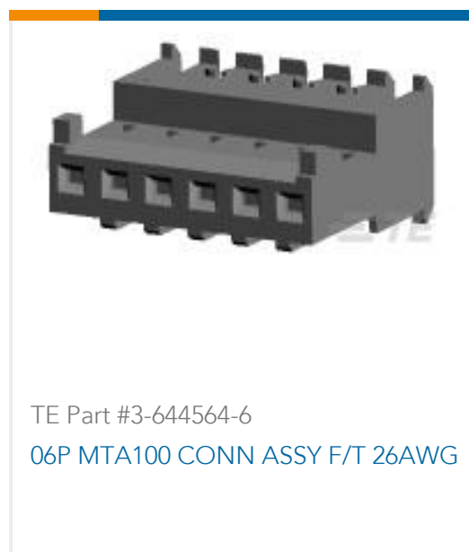
TE Part #3-644564-6 06P MTA100 CONN ASSY F/T 26AWG