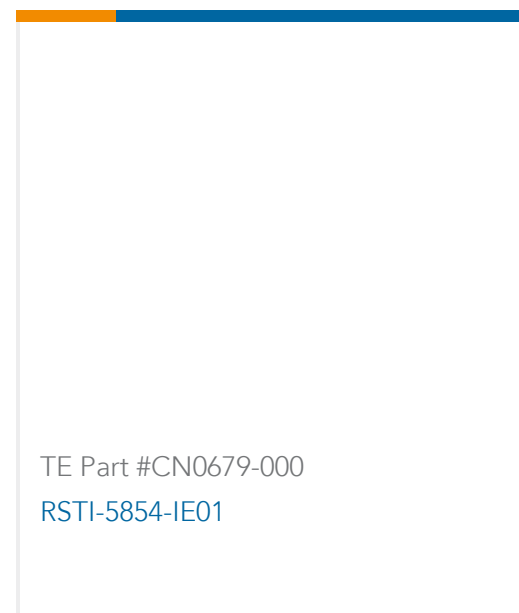
TE Part #CN0679-000 RSTI-5854-IE01