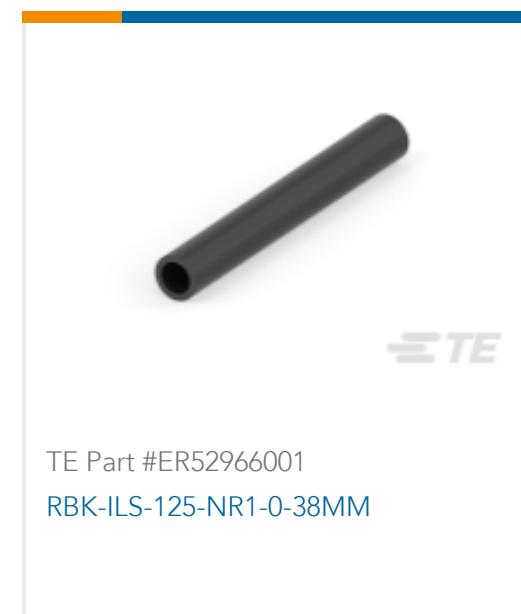
TE Part #ER52966001 RBK-ILS-125-NR1-0-38MM