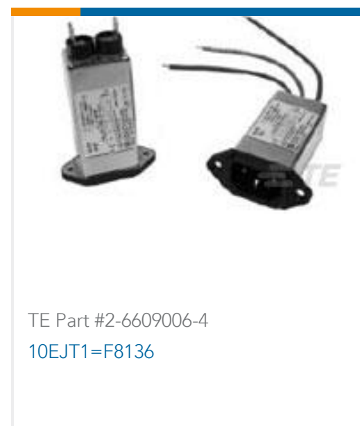
TE Part #2-6609006-4 10EJT1=F8136