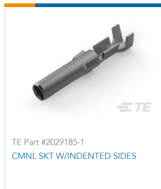
TE Part #2029185-1 CMNL SKT W/INDENTED SIDES