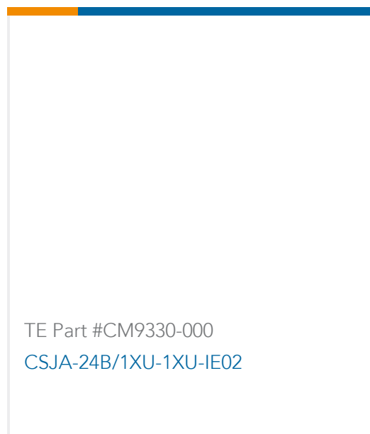
TE Part #CM9330-000 CSJA-24B/1XU-1XU-IE02