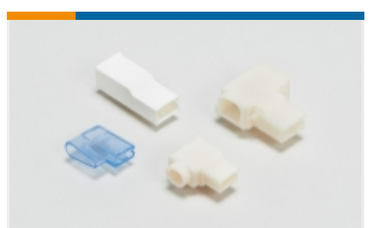
Crimp Terminal Housings(1)