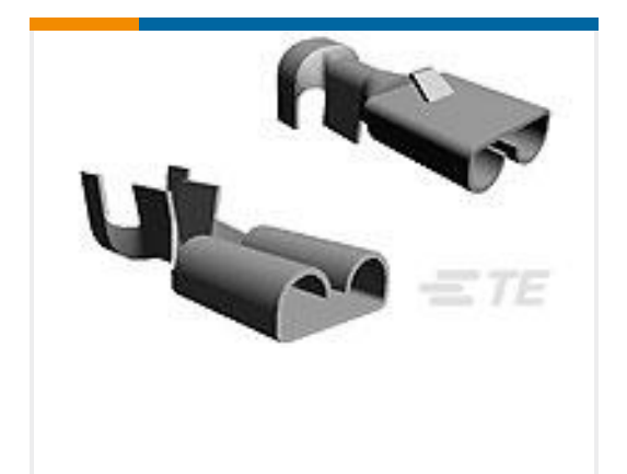
TE Part #160684-4 FF 110 REC 0.5-1.0MM2 TPBR