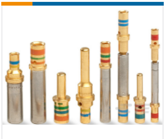
TE Part #38946-16L CONT SOC ASSY