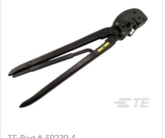
TE Part # 59239-4 HHHT PIDG PG 12-10 ASSY