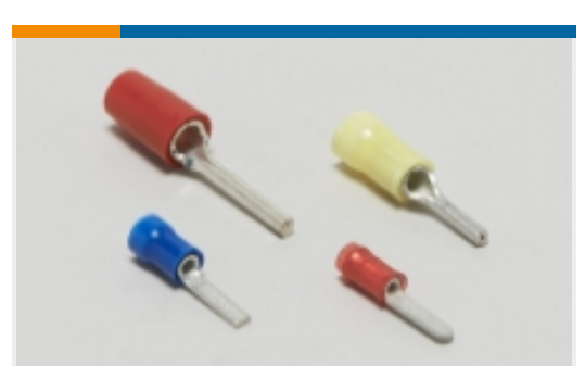
Crimp Wire Pins, Tabs & Ferrules(41)