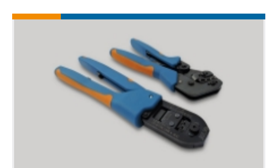
Hand Crimping Tools(2)