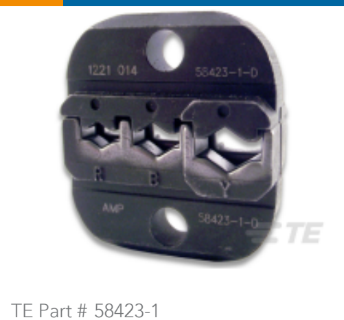
DIE, RBY IS9252