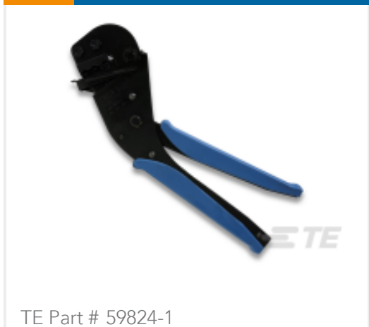
TETRA-CRIMP PIDG PG FASTON 22-10 ASSY