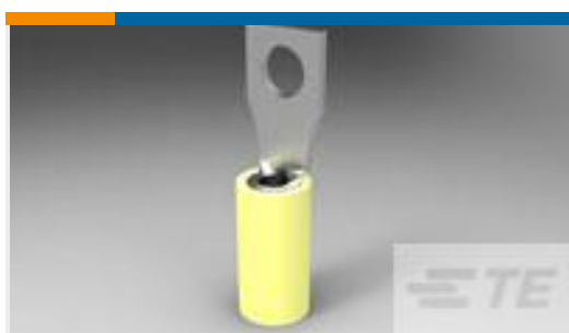
TE Part #2-327960-2 TERMINAL,PIDG RECT 12-10 6