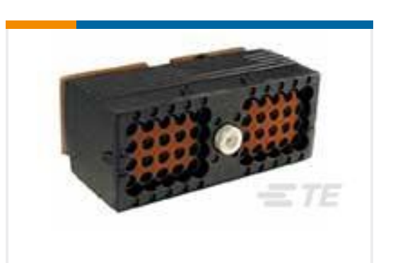
TE Part #DRC18-40SB PLG, 40P, BLK, N, B