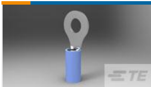
TE Part #321045 TERMINAL,PIDG R 16-14 1/4