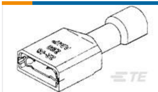
TE Part #3-520406-2 ULTRA-FAST 250 ASY REC 16-14 AWG TPBR