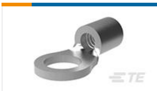
TE Part #2-34125-6 TERMINAL,SOLIS R 16-14 5/16