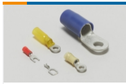
Ring Terminals & Spade Terminals(861)