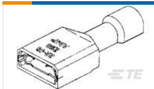
TE Part #4-520448-2 ULTRAFAST 250 ASSY REC 12-10 TPBR LP