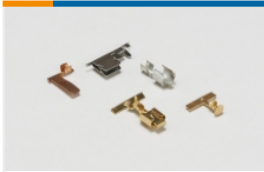
Special Purpose Terminals(1)