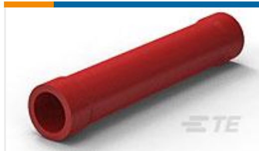
TE Part #8-34070-1 PG BUTT SPLC 22-16COMM22-18MIL