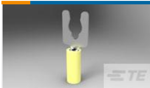
TE Part #52941-1 TERMINAL,PIDG SPR SPD 12-10 6