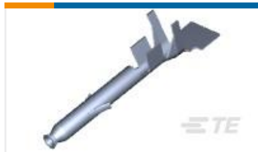
TE Part #770904-6 MINI UMNL SOK CONT 22-18AWG AU