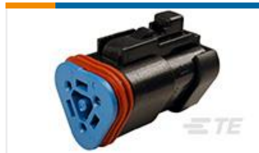
TE Part #DT06-3S-EP10 PLG, 3P, BLK, 120 OHM RESISTOR