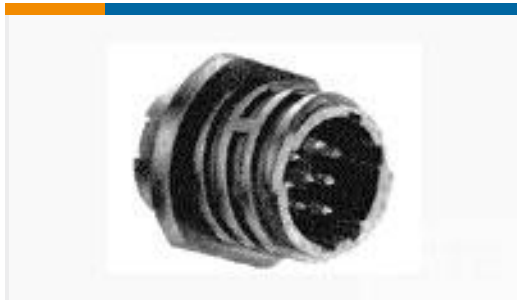
TE Part #206486-2 CPC RECPT ASSEMBLY SIZE 11-9