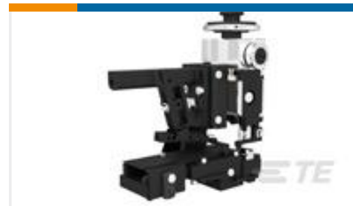
TE Part #2151314-1 OCEAN_2.0_Applicator-S-110F155F