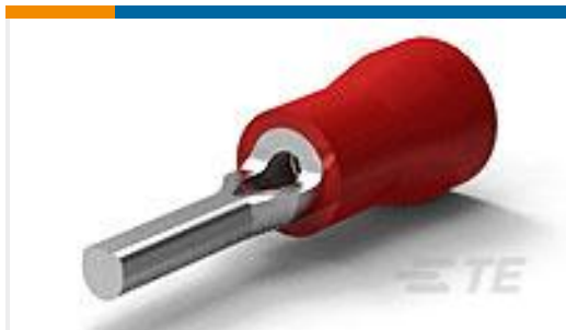
TE Part #165143 PG WIRE PIN 22-16