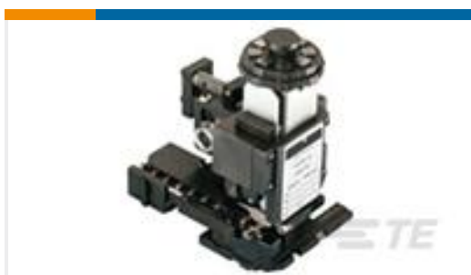
TE Part #466779-6 APPL,HDM 5SAPR176D G