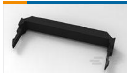
TE Part #499252-6 034 STRAIN RELIEF A-L RCPT