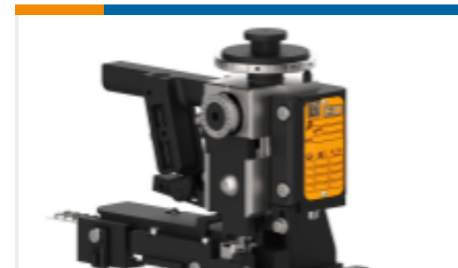
TE Part #2837605-1 OCEAN-2.0-APPLICATOR-S-112O160F