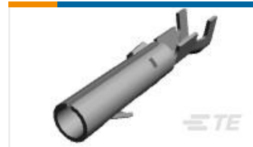
TE Part #61314-6 CMNL SOK S/F 24-18 .0125AUPHBZ