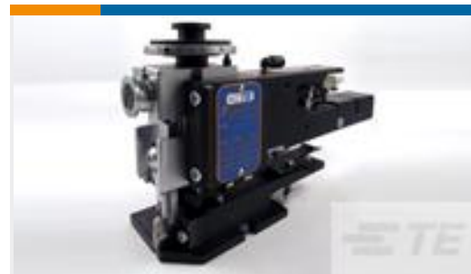
TE Part #2150041-2 OCEAN_2.0_Applicator-E-110F180F