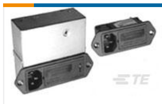
TE Part #2-6609129-1 SEFM1=F8092