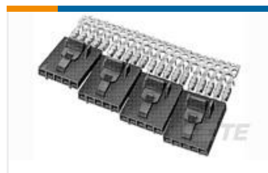
TE Part #5-103957-1 10X2 MTE RCPT SR LATCH .100CL