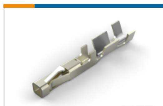
TE Part #1-794606-3 MICRO MNL RPT CNT STRP 30AU LF