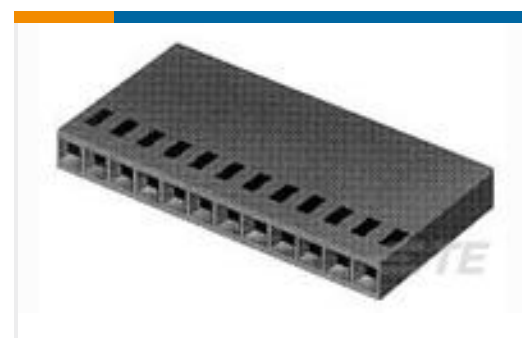
TE Part #925366-2 MOD 4 REC.HSG 1X02P