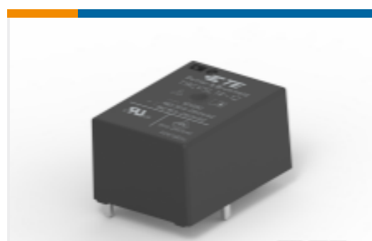
TE Part #1558661-5 T9GV1L14-18