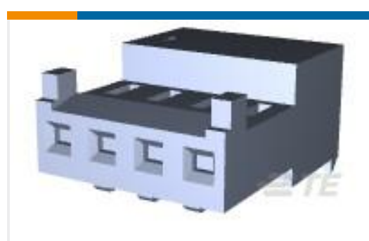
TE Part #3-644043-4 04P MTA100 CONN ASSY LF