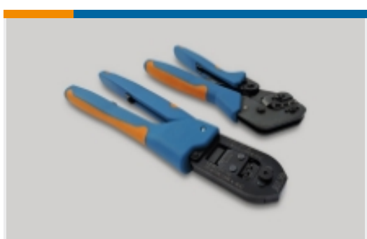
Hand Crimping Tools(2)