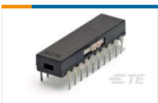
TE Part #2-1825011-2 ASF42G04=4PDT AUTOSLIDE