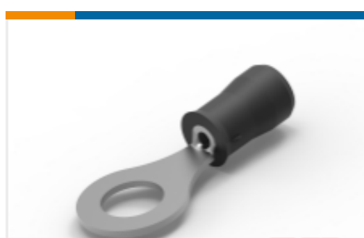
TE Part #53942-2 PIDG Ring Tongue Terminals