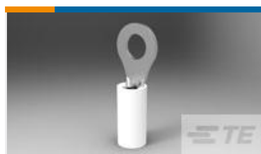
TE Part #152873 14-12 PIDG NYLON RT NO 8 WHITE