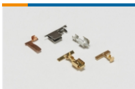
Special Purpose Terminals(1)