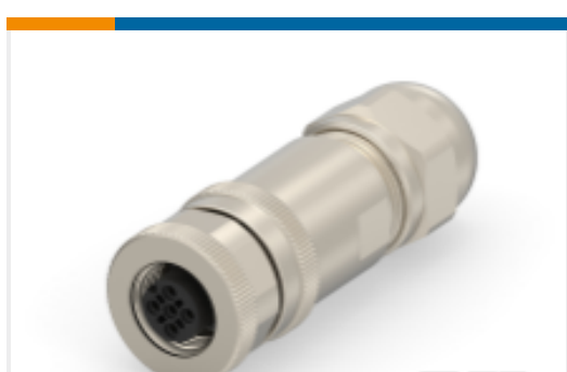
TE Part #T4110011051-000 M12 F, 5P GOLDR A_CODE S SHIELDED PG7