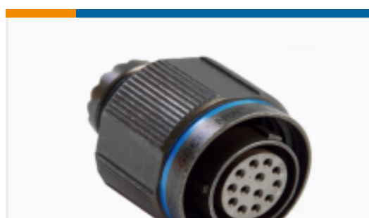
TE Part #YDTS26W13-98SNV001 PLUG ASSY