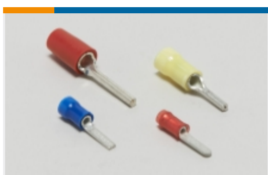
Crimp Wire Pins, Tabs & Ferrules(41)