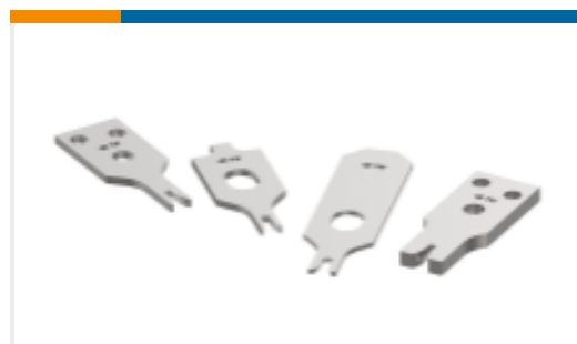
TE Part #1803364-2 CRIMPER, WIRE, F PREMIUM NON- TYPICAL RK