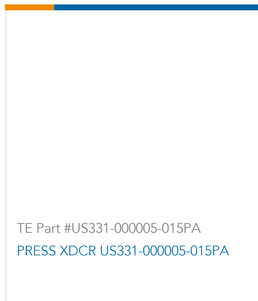
TE Part #US331-000005-015PA PRESS XDCR US331-000005-015PA