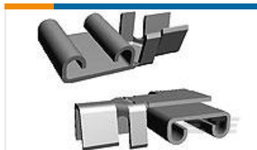
TE Part #63137-1 250 FASOTN FLAG REC 20-16 AWG TPBZ