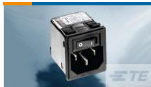
TE Part #2-1609114-1 15CUFS1=F8302