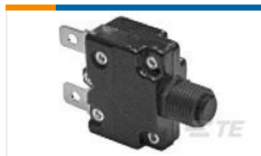
TE Part #5-1423364-9 W57-XB6A99C10-20=CKTBKR,THERM, PB,QC.250