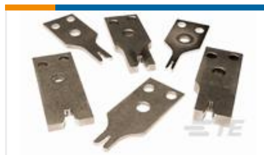
TE Part #1803019-4 CRIMPER, INSULATION O