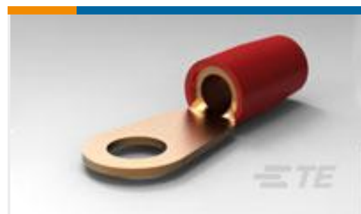
TE Part #324082 TERMINAL,T-N R 8 1/4