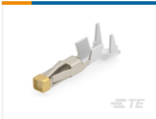
TE Part # 1-2834067-3 SOCKET CONTACT, MINIATURE WATERPROOF CONN