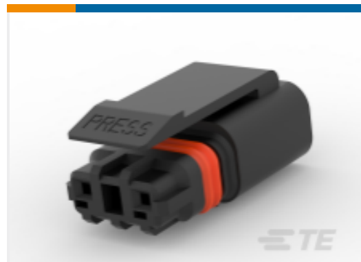
TE Part #1-2834074-2 SlimSeal Miniature Plugs