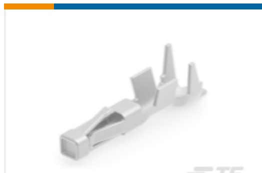
TE Part #2-2834067-2 SOCKET CONTACT, MINIATURE WATERPROOF CONN