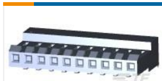
TE Part #4-640427-0 10P MTA156 CONN ASSY 20AWG YEL