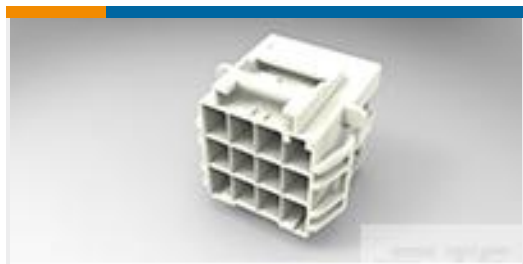
TE Part #1-1971875-4 PTL 3X4 CAP PANEL MT STD TEMP KEY A NAT