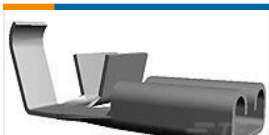
TE Part #61459-1 110 FASTON FLAG REC 22-18 AWG TPBR