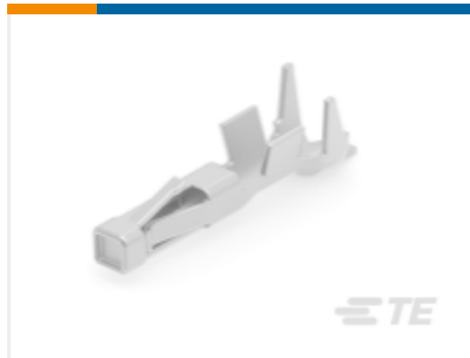
TE Part # 1-2834067-2 SOCKET CONTACT, MINIATURE WATERPROOF CONN