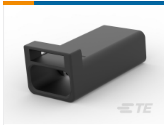
TE Part # 2-2834075-2 2P REC, MINIATURE WATERPROOF CONN.BLACK