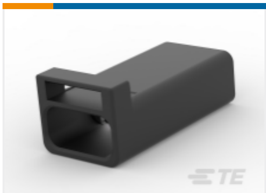
TE Part #2-2834075-3 SlimSeal Miniature Receptacles