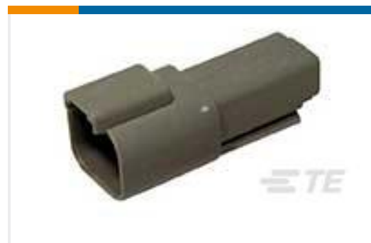
TE Part #DT04-2P REC, 2P, GRY, N