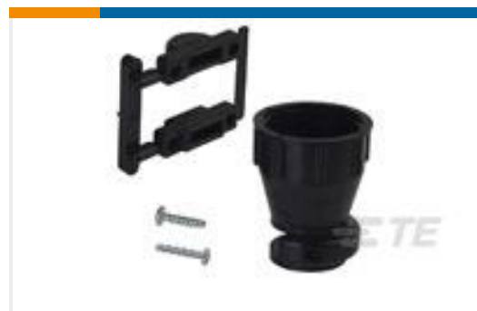
TE Part #206070-8 CABLE CLAMP KIT #17