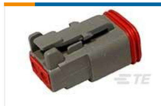
TE Part #DT06-2S PLG, 2P, GRY, N