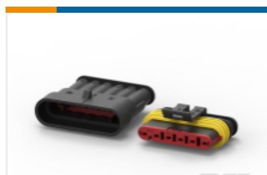
TE Part #282080-1 AMP SUPERSEAL 1.5MM, CONNECTOR HOUSING