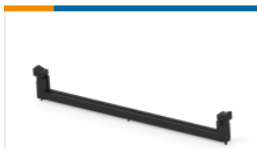
TE Part #2-2355626-1 DDR5 DIMM BLACK HSG AND BLACK LATCH