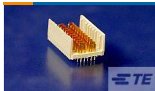
TE Part #1469025-1 HM-ZD 2PR HDR 40P 2.5MM