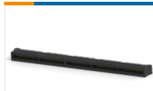
TE Part #2328461-2 280 POS., CONNECTOR ASSEMBLY, SLIVER 2.0