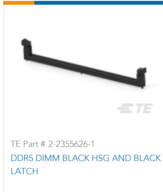
TE Part # 2-2355626-1 DDR5 DIMM BLACK HSG AND BLACK LATCH