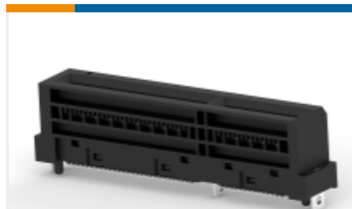
TE Part #2327678-2 RECEPTACLE ASSY, 84 P, VERT, SLIVER 2.0