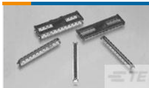
TE Part #6-5353606-6 .5FHR04H,220,S,GIG,08/Sn,HT,SEYes