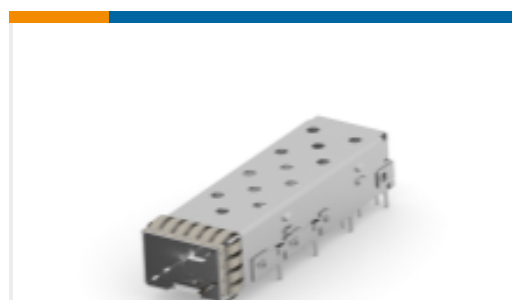
TE Part #2316664-1 SFP+ 1x1 Cage Assembly, PCI, Solder Tail