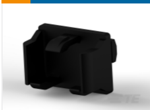
TE Part # 1761394-1 DUST COVER, SFP, GANGED & STACKED