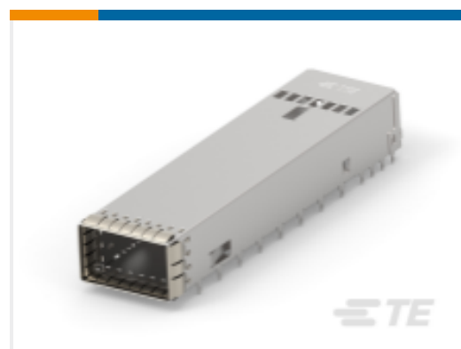
TE Part #2317416-1 OSFP 1X1 CAGE ASSMBLY