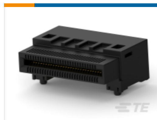
TE Part #2324869-1 CONNECTOR ASSEMBLY, SMT, PDNI, OSFP