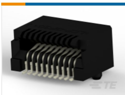
TE Part #1367073-1 SFP Connectors