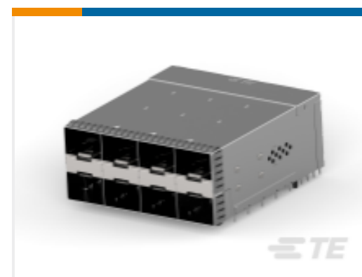
TE Part #2339978-5 SFP56 STACKED 2X4 RECEPTACLE ASSEMBLY