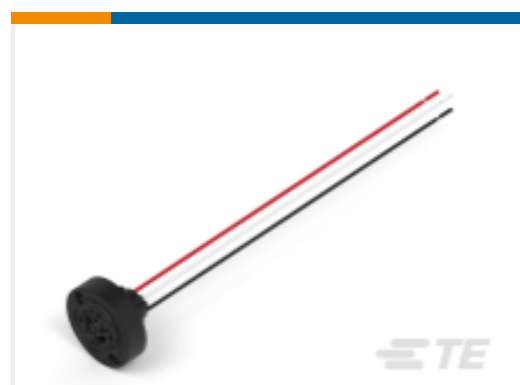
TE Part #6-2213362-2 RCPT ASSY,DIMMABLE PHOTOCNTROL,150C,3 P