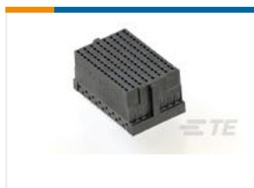
TE Part #1934949-1 Tinman 5pr 8col vert rcpt 15mm stack