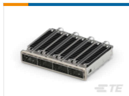
TE Part #1-2170287-1 1X4 CAGE ASSEMBLY, QSFP,SINGLE SQ LP