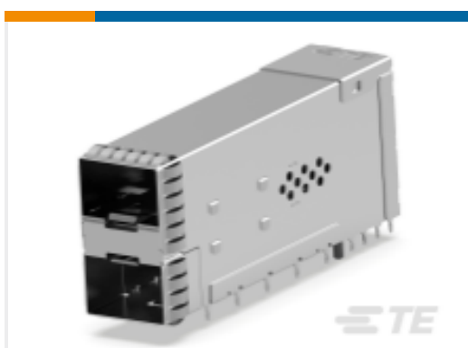
TE Part #2349202-5 SFP56 STACKED 2X1 RECEPTACLE ASSEMBLY