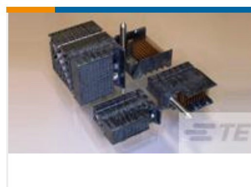
TE Part #2007808-2 IMP100S,H,V4P10C,LG,OEW46,4.9