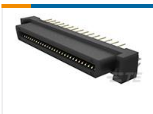
TE Part #1734101-3 Champ050 series,30pos,Au over PdNi