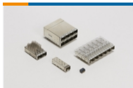
SFP, SFP+ & zSFP+(53)