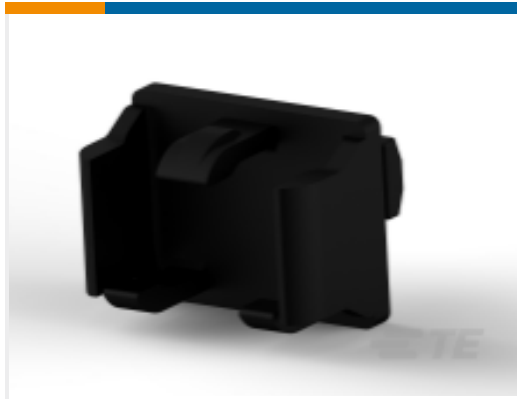
TE Part # 1761394-1 DUST COVER, SFP, GANGED & STACKED