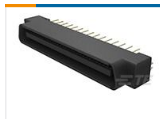
TE Part #1734100-3 Champ050 series,30pos,Au over PdNi