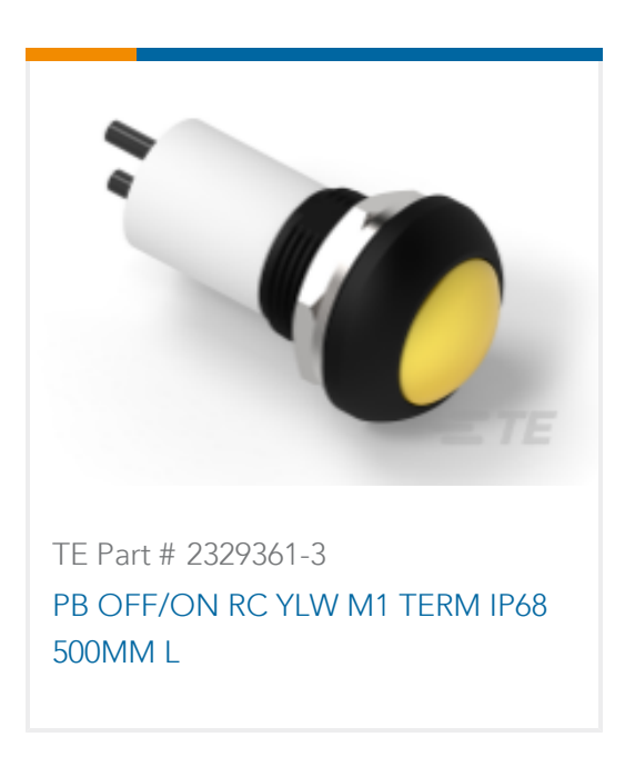
Also in the Series | Alcoswitch PB7