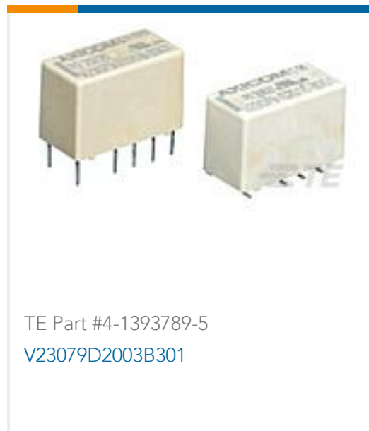
TE Part #4-1393789-5 V23079D2003B301