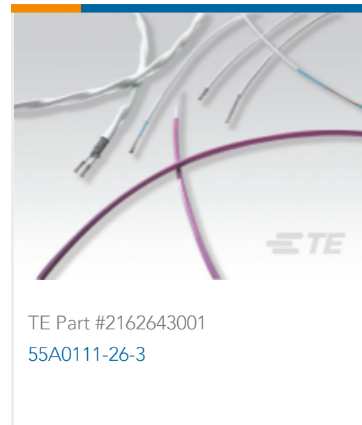
TE Part #2162643001 55A0111-26-3