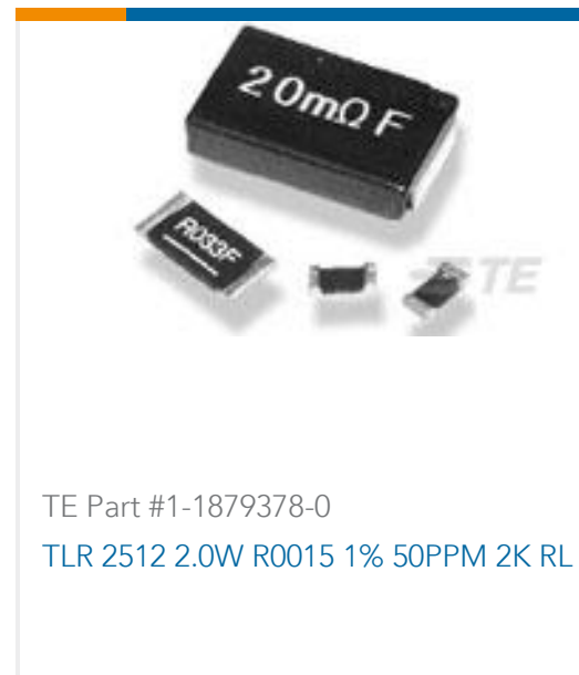
TE Part #1-1879378-0 TLR 2512 2.0W R0015 1% 50PPM 2K RL