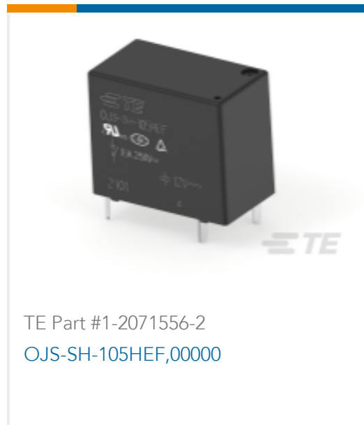
TE Part #1-2071556-2 OJS-SH-105HEF,00000