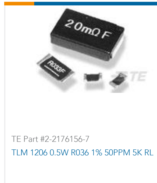
TE Part #2-2176156-7 TLM 1206 0.5W R036 1% 50PPM 5K RL