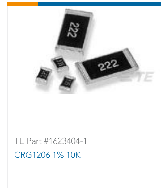
TE Part #1623404-1 CRG1206 1% 10K