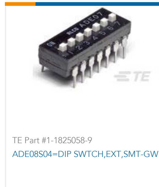
TE Part #1-1825058-9 ADE08S04=DIP SWITCH,EXT,SMT-GW