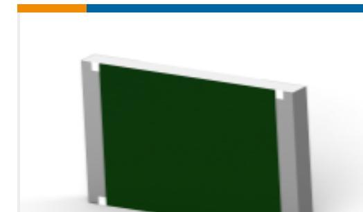
TE Part #8-2176407-8 3560 27R 5%