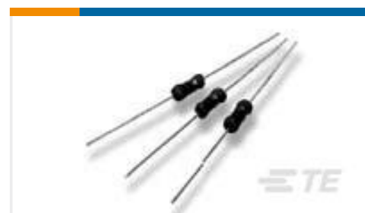
TE Part #4-1879350-2 RR01 5% 11R AMMO