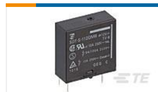
TE Part #8-1419125-5 SDT-S-106LMR,000