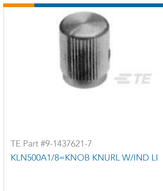
TE Part #9-1437621-7 KLN500A1/8=KNOB KNURL W/IND LI