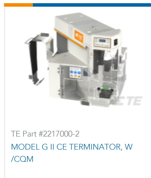
TE Part #2217000-2 MODEL G II CE TERMINATOR, W /CQM