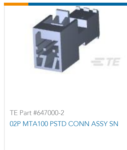
TE Part #647000-2 02P MTA100 PSTD CONN ASSY SN