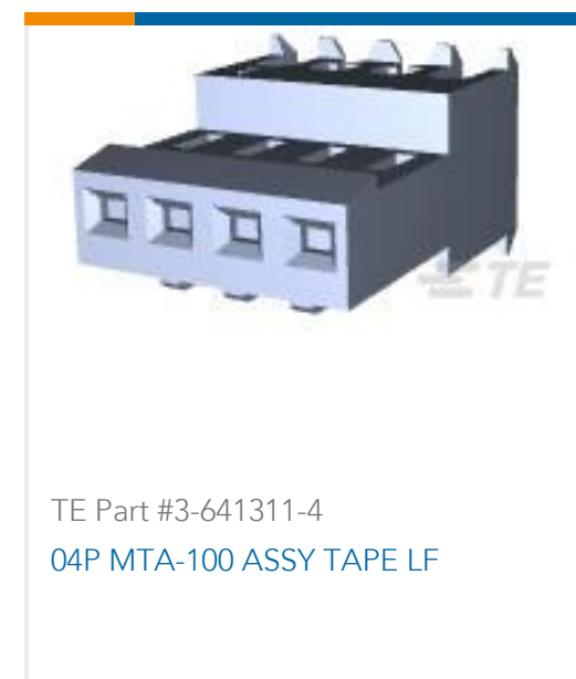
TE Part #3-641311-4 04P MTA-100 ASSY TAPE LF