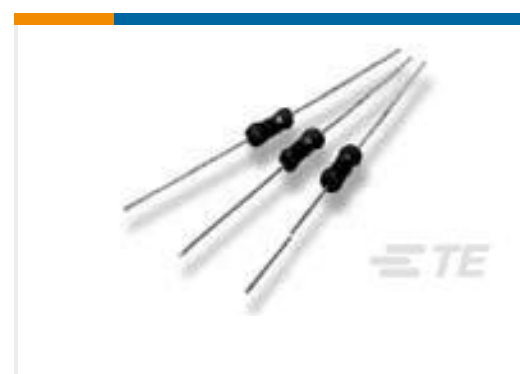
TE Part #4-1879350-2 RR01 5% 11R AMMO