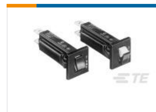
TE Part #1-1393250-7 W28-XQAT-15=W28