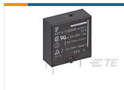
TE Part #8-1419125-5 SDT-S-106LMR,000