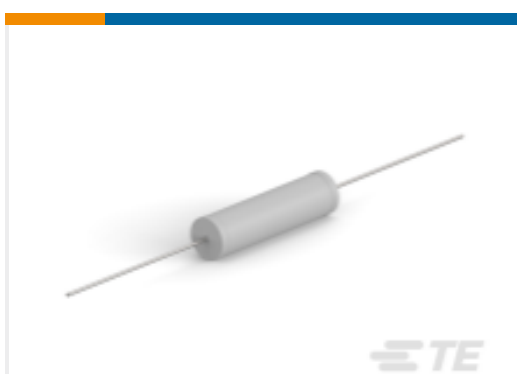
TE Part #4-2176414-8 7W STD M/OX 5% 1K8