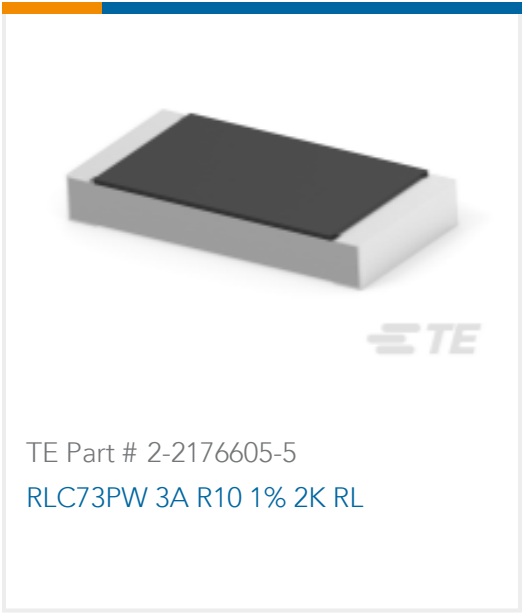
TE Part # 2-2176605-5 RLC73PW 3A R10 1% 2K RL