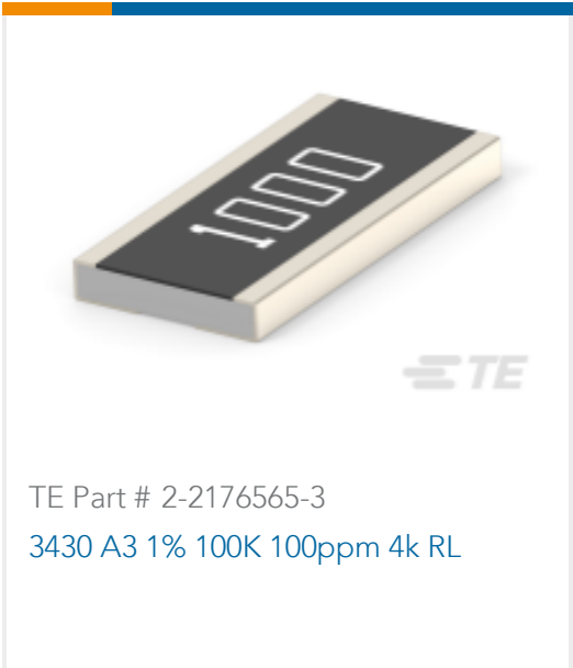
TE Part # 2-2176565-3 3430 A3 1% 100K 100ppm 4k RL