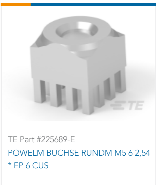
TE Part #225689-E POWELM BUCHSE RUNDM M5 6 2,54 * EP 6 CUS