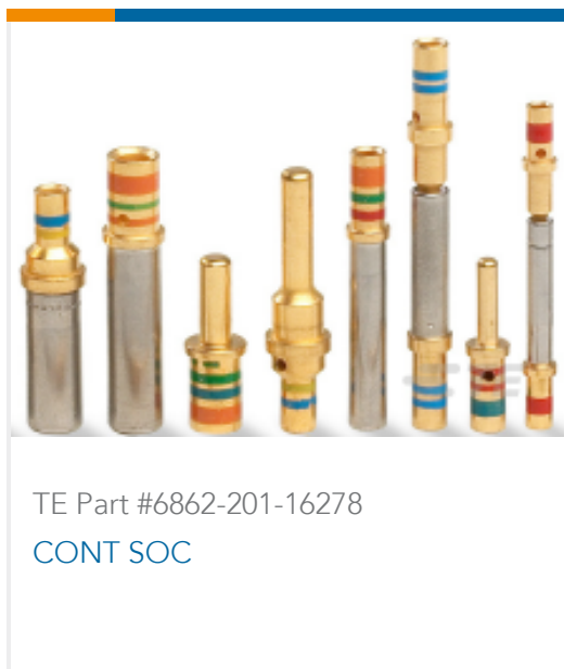
TE Part #6862-201-16278 CONT SOC