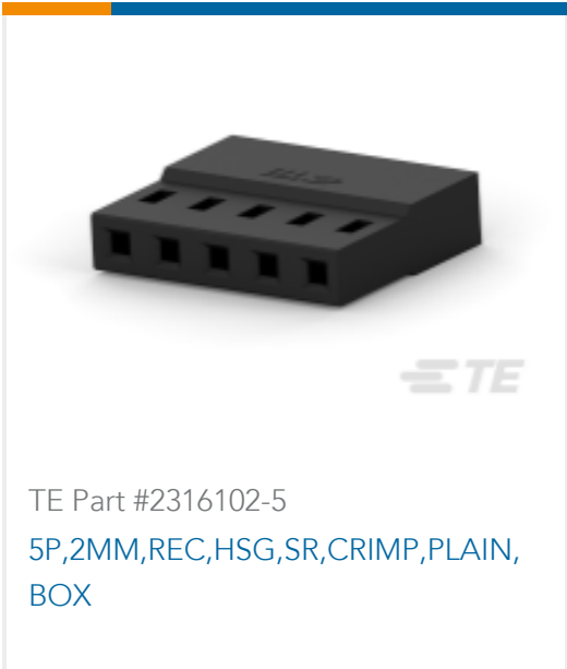
TE Part #2316102-5 5P,2MM,REC,HSG,SR,CRIMP,PLAIN, BOX