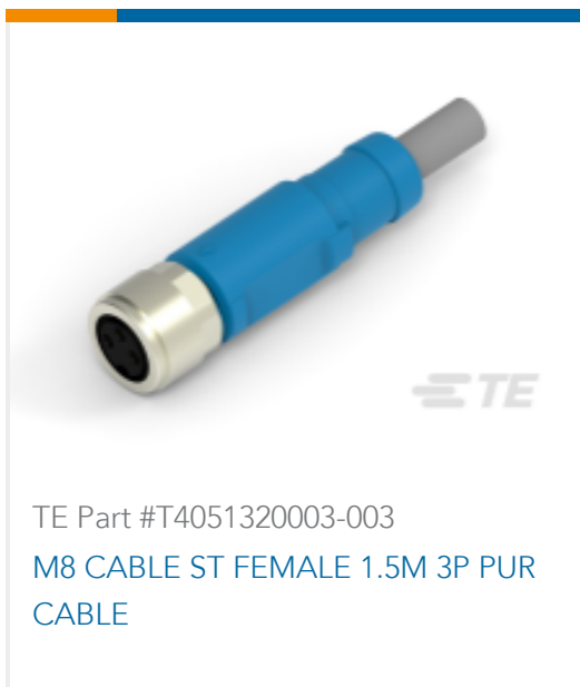
TE Part #T4051320003-003 M8 CABLE ST FEMALE 1.5M 3P PUR CABLE