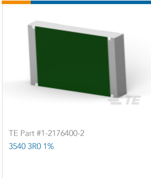
TE Part #1-2176400-2 3540 3R0 1%