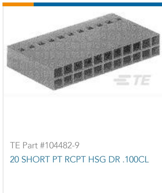
TE Part #104482-9 20 SHORT PT RCPT HSG DR .100CL