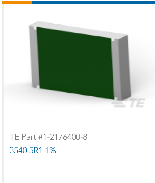
TE Part #1-2176400-8 3540 5R1 1%