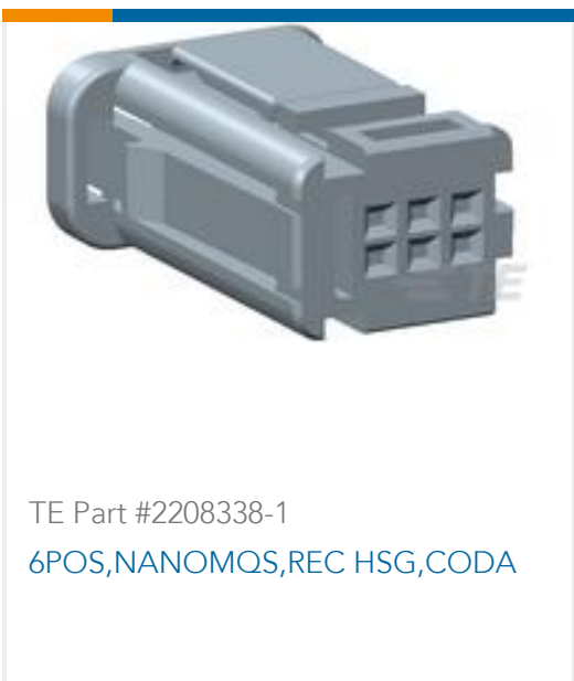
TE Part #2208338-1 6POS,NANOMQS,REC HSG,CODA