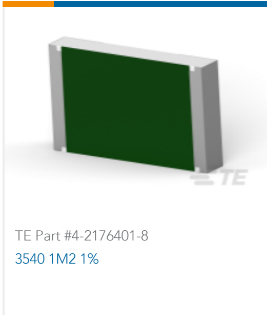
TE Part #4-2176401-8 3540 1M2 1%