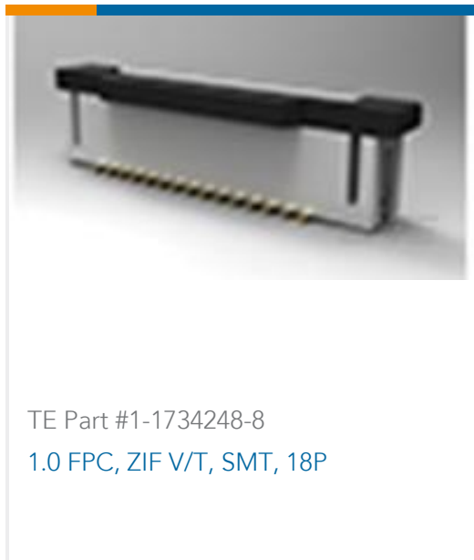
TE Part #1-1734248-8 1.0 FPC, ZIF V/T, SMT, 18P