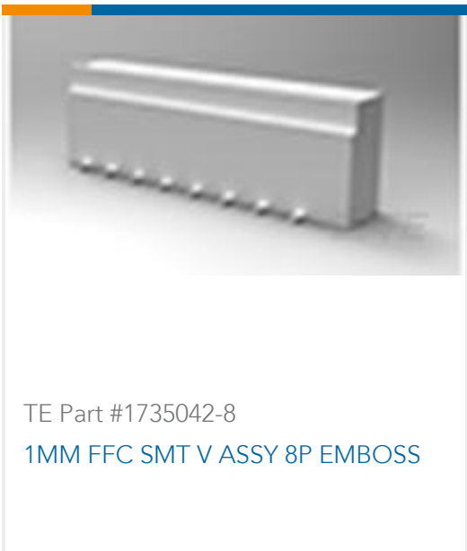
TE Part #1735042-8 1MM FFC SMT V ASSY 8P EMBOSS