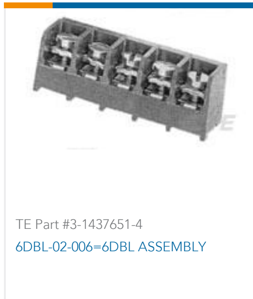
TE Part #3-1437651-4 6DBL-02-006=6DBL ASSEMBLY