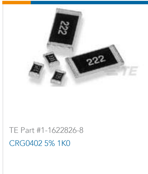
TE Part #1-1622826-8 CRG0402 5% 1K0