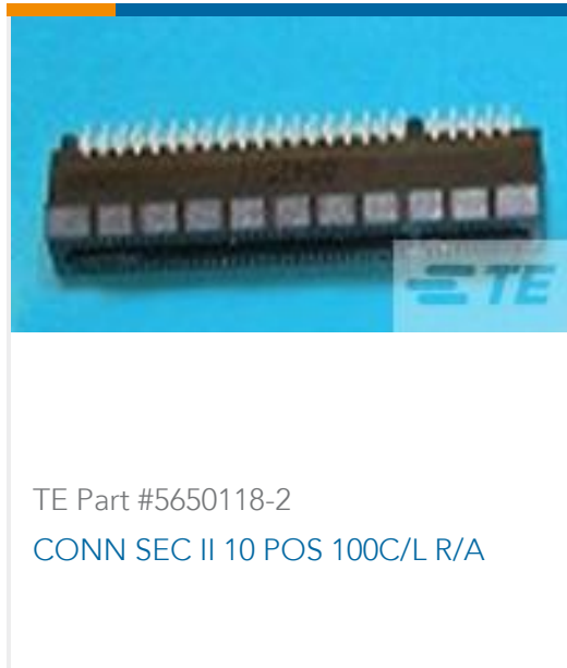
TE Part #5650118-2 CONN SEC II 10 POS 100C/L R/A