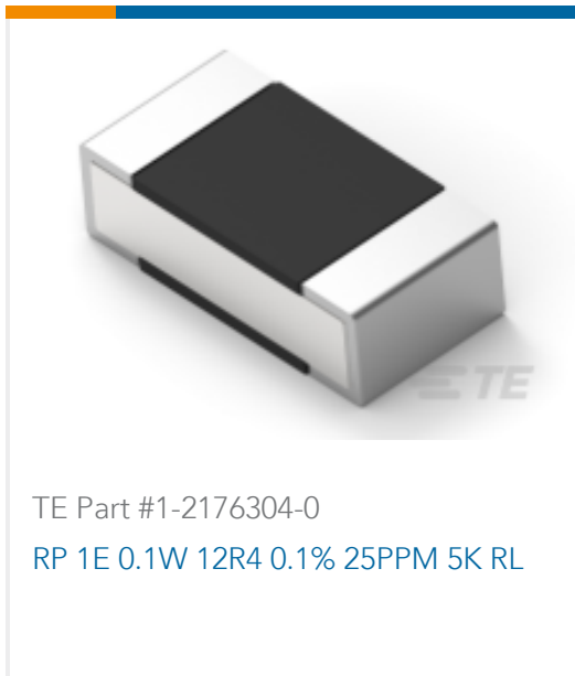
TE Part #1-2176304-0 RP 1E 0.1W 12R4 0.1% 25PPM 5K RL