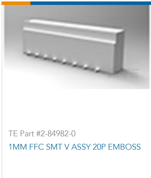
TE Part #2-84982-0 1MM FFC SMT V ASSY 20P EMBOSS