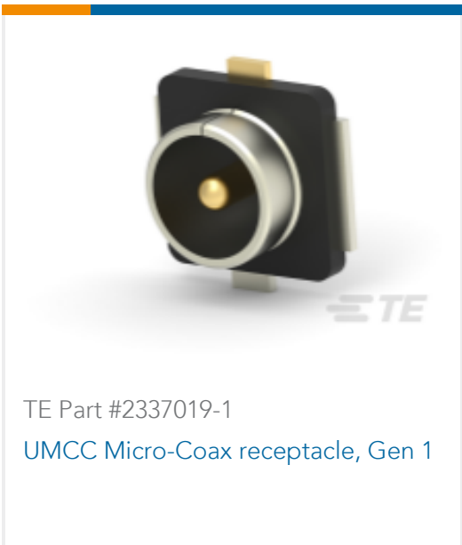
TE Part #2337019-1 UMCC Micro-Coax receptacle, Gen 1