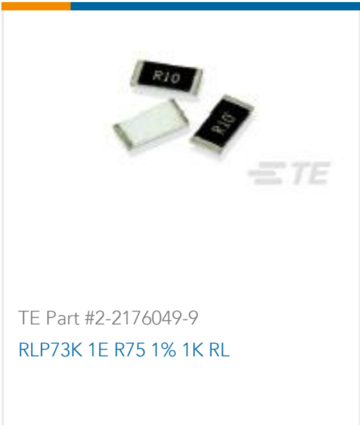
TE Part #2-2176049-9 RLP73K 1E R75 1% 1K RL