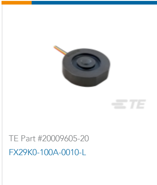
TE Part #20009605-20 FX29K0-100A-0010-L