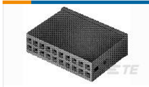
TE Part #925370-8 MOD IV REC HSG, 2X8P