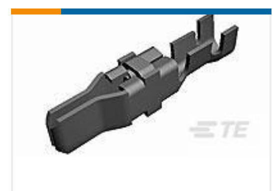
TE Part #66261-2 MALE CONTACT ASSY. (L.P.)