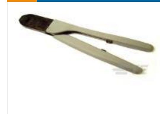
TE Part #91548-1 CCII HD-20 PIN SKT 28-20 ASSY