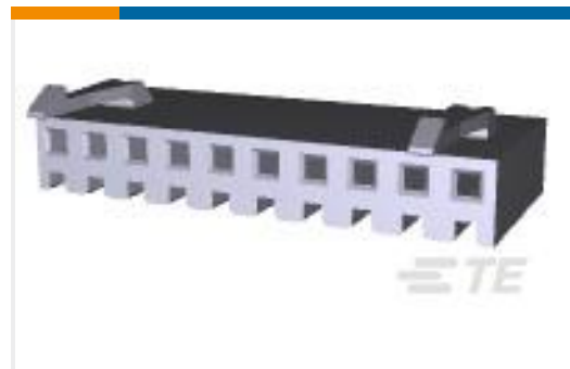
TE Part #1-770894-0 10P SL156 HSG W/THRU BD LATCH