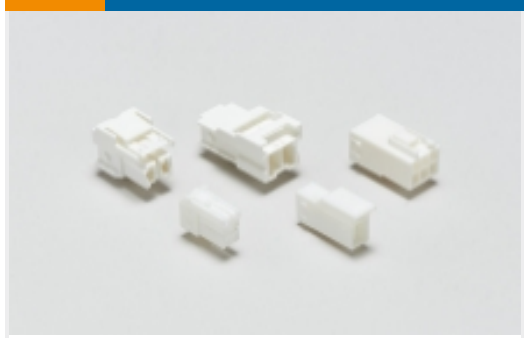
Rectangular Power Connectors(300)