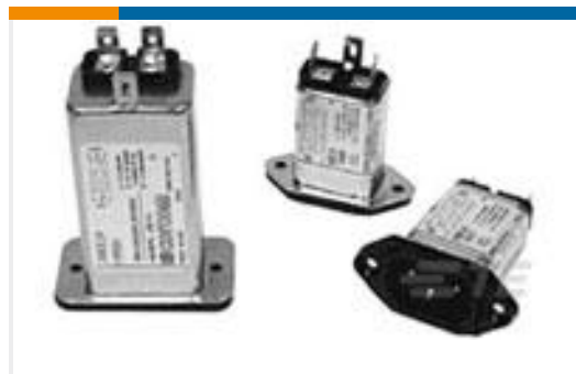
TE Part #3-6609006-3 3EEJ8=F8011