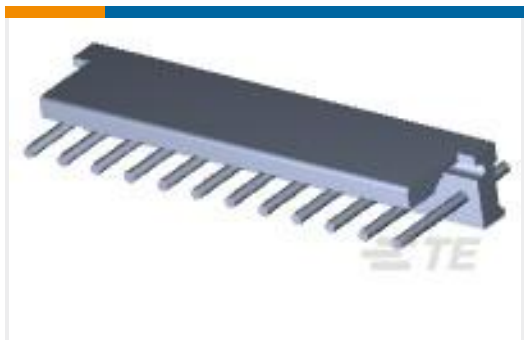
TE Part #4-641209-2 12P MTA156 HDR ASSY FL ST LF