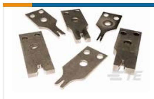
TE Part #464290-3 CRIMPER, SEMI-FLAT 12-10