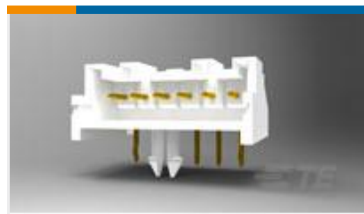
TE Part #2-1744426-0 Header Housing Assy, EP 2.5 RA, 20 Pos.