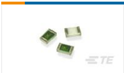
TE Part #5-1879127-5 RN 0402 383R 0.1% 10PPM CUT LENGTH