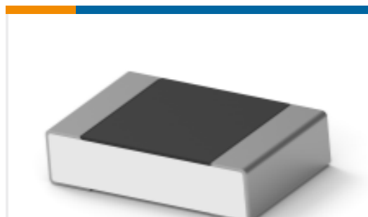
TE Part #7-2176376-2 RQ 0805 68K1 0.1% 10PPM 1K RL