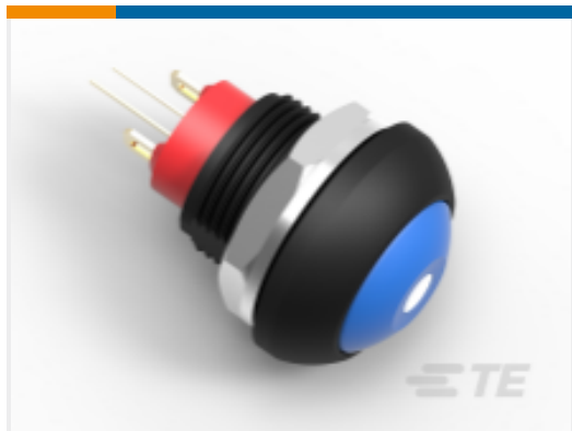
TE Part #2-2329387-1 PB OFF/ON FC BLU M1 TERM WHI LED IP68