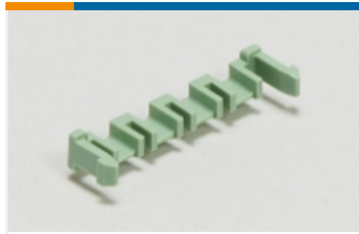
PCB Latches, Locks & Retainers(49)