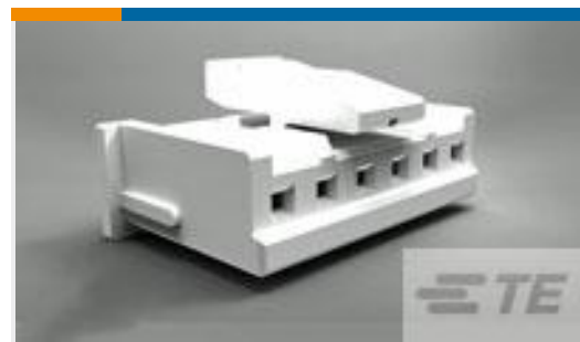
TE Part #2-1969442-0 EP 2.5 TPA Housing, 20 Pos