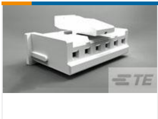
TE Part #2-1744417-0 20 POS EP 2.5 HSG, GLOW WIRE