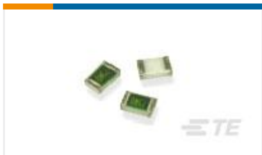
TE Part #4-1879126-0 RN 0402 154R 0.1% 10PPM CUT LENGTH