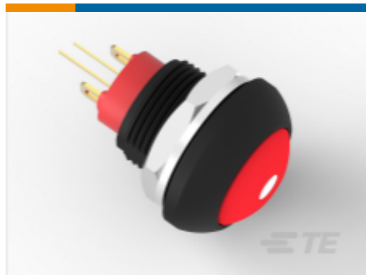
TE Part #2329387-6 PB OFF/ON FC RED M1 TERM WHI LED IP68