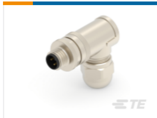
TE Part #T4113011031-000 M12 M, 3P GOLD A_CODE RA SHIELDED PG7