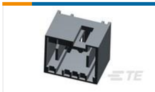
TE Part #2232511-3 3P, RAST 5 TAB HEADER, THV