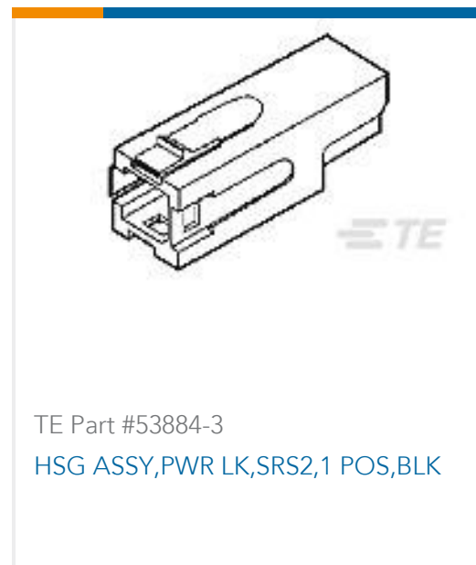
TE Part #53884-3 HSG ASSY,PWR LK,SRS2,1 POS,BLK