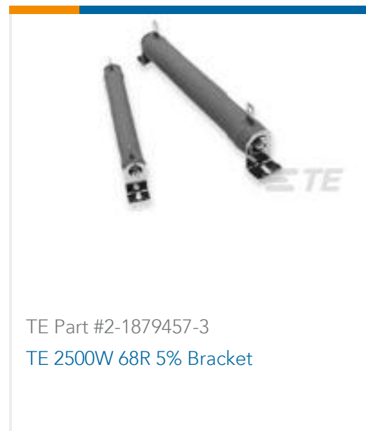
TE Part #2-1879457-3 TE 2500W 68R 5% Bracket