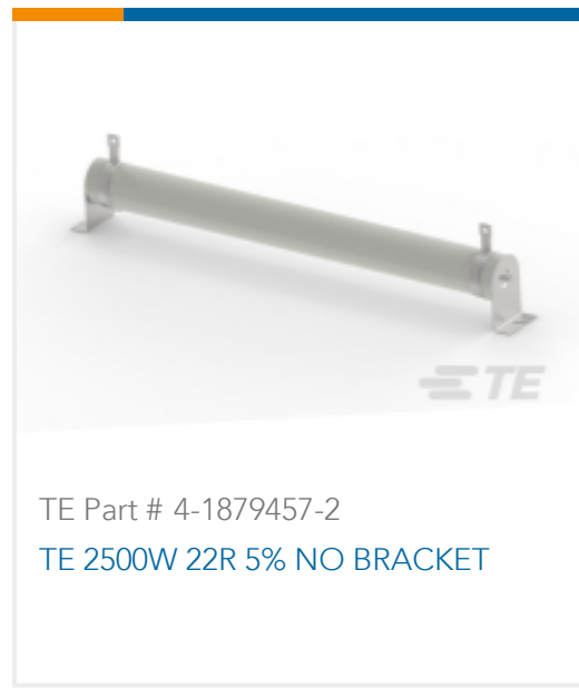
TE Part # 4-1879457-2 TE 2500W 22R 5% NO BRACKET