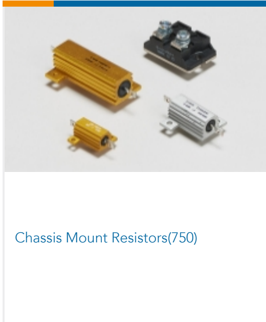
Chassis Mount Resistors(750)