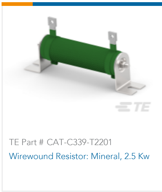
TE Part # CAT-C339-T2201 Wirewound Resistor: Mineral, 2.5 Kw