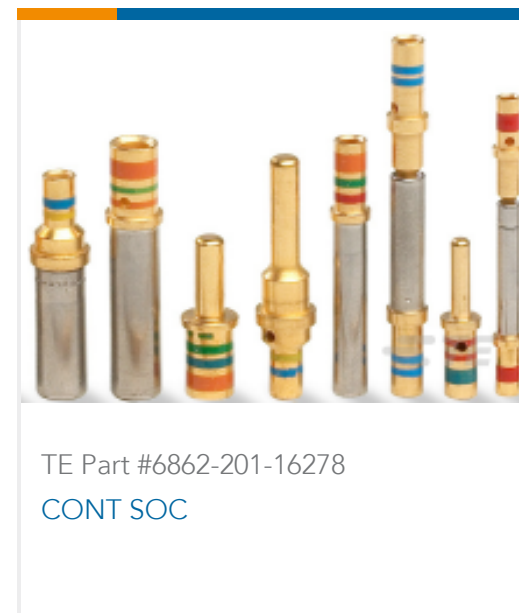
TE Part #6862-201-16278 CONT SOC