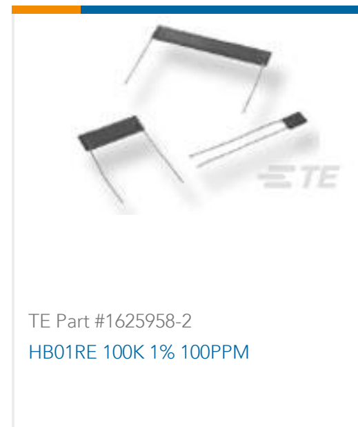
TE Part #1625958-2 HB01RE 100K 1% 100PPM