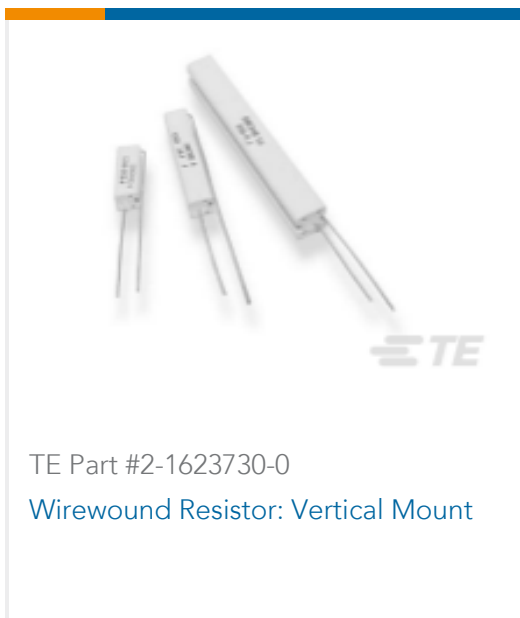
TE Part #2-1623730-0 Wirewound Resistor: Vertical Mount