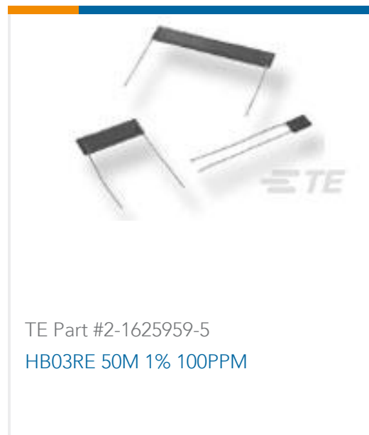
TE Part #2-1625959-5 HB03RE 50M 1% 100PPM