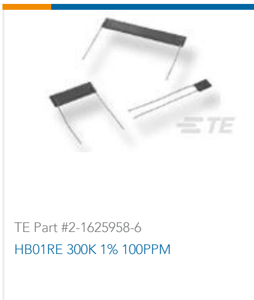
TE Part #2-1625958-6 HB01RE 300K 1% 100PPM