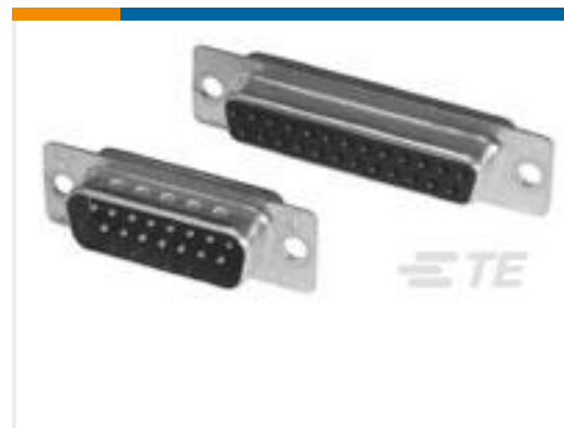
TE Part #5-747912-4 25 PLUG SOLDER CUP STD DUPL, R