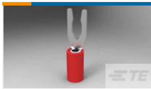
TE Part #52409 TERMINAL,PIDG SPR SPD 22-16 6