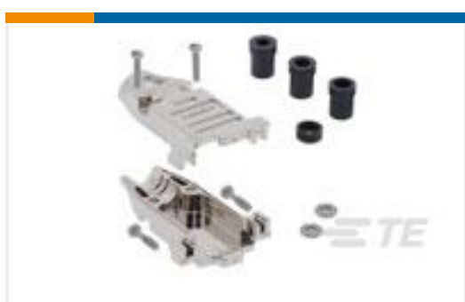
TE Part #5748677-1 PLTD PLST CBL CLMP KIT,SZ 1