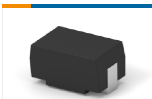
TE Part #1879234-3 SMD Power Resistor: 7 Watt, 200-2M Ohm