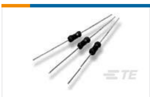
TE Part #7-1879352-8 RR02 5% 510R AMMO