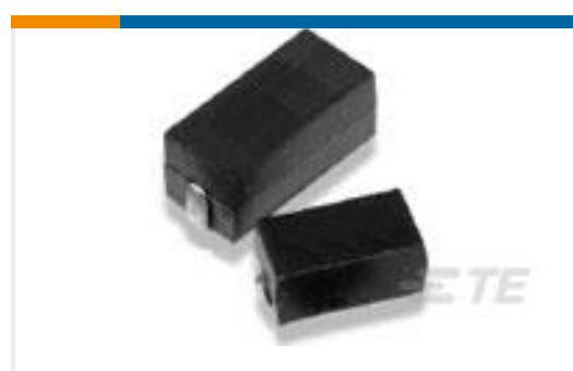
TE Part #8-1879233-9 SMW5 470R 5%