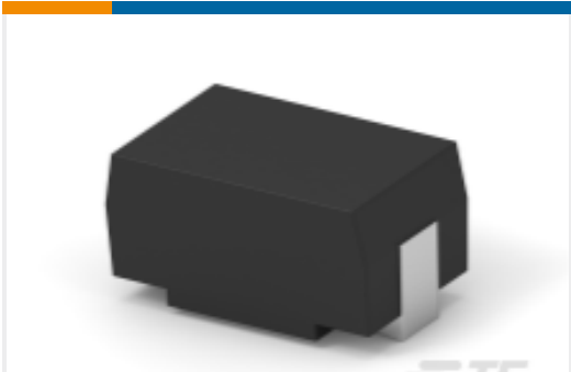
TE Part #1-1879233-7 SMD Power Resistor: 7 Watt, 0.10-500 Ohm