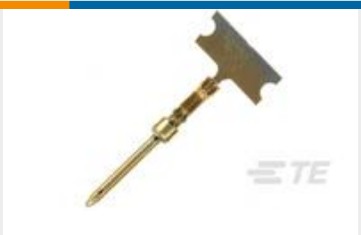
TE Part #1658540-2 PIN CONT DUPL PLT LP HD-20 AMP