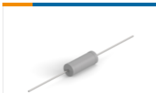
TE Part #2176413-5 5W XSM M/OX 5% 100K