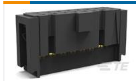
TE Part #1658527-4 622-1041LF FEM SOCKET, LEAD FREE