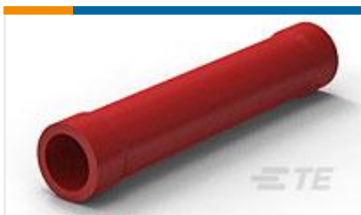
TE Part #34070 PG BUTT SPLC 22-16COMM22-18MIL