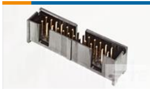
TE Part #2-1761603-3 IDC LOW PRO HDR 10P VERT BLUE