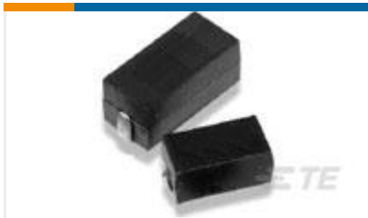
TE Part #7-1879022-1 SMF3 270K 5%