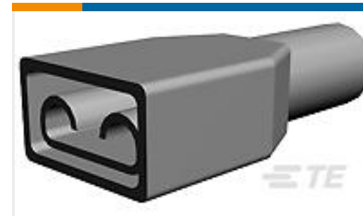
TE Part #735160 250 PIDG FAST REC