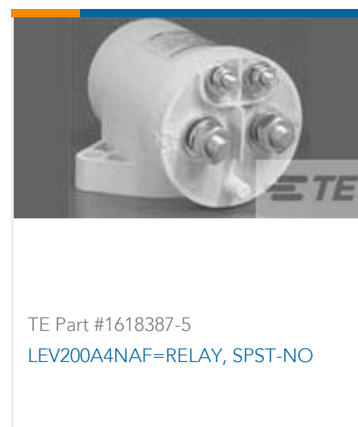
TE Part #1618387-5 LEV200A4NAF=RELAY, SPST-NO