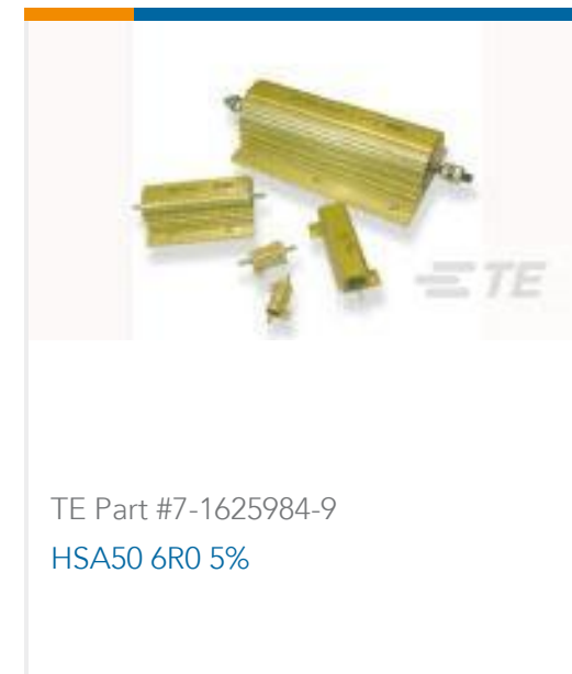
TE Part #7-1625984-9 HSA50 6R0 5%