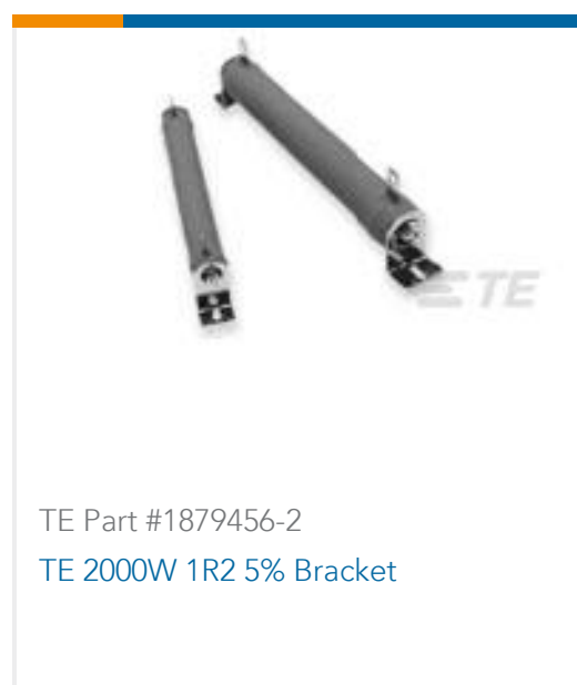
TE Part #1879456-2 TE 2000W 1R2 5% Bracket