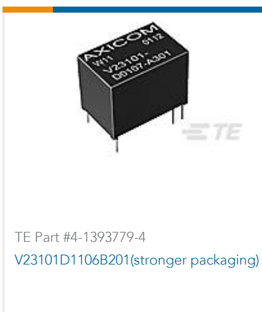
TE Part #4-1393779-4 V23101D1106B201(stronger packaging)