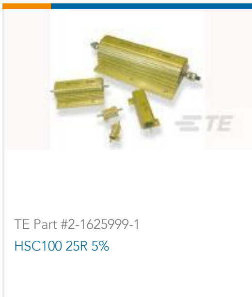
TE Part #2-1625999-1 HSC100 25R 5%