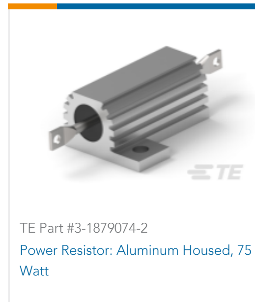
TE Part #3-1879074-2 Power Resistor: Aluminum Housed, 75 Watt