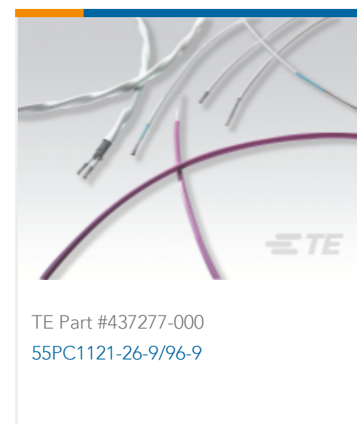
TE Part #437277-000 55PC1121-26-9/96-9