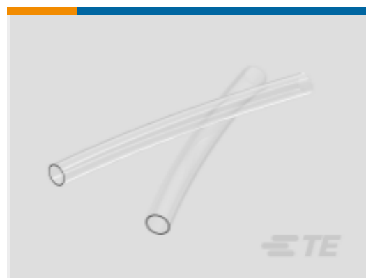
TE Part #CX7479-000 ES1000 Heat shrink Tubing