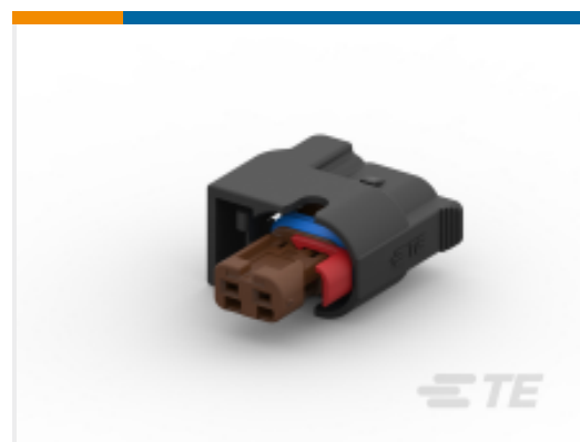
TE Part #2098641-2 2POS, MCON 1.2 CB REC 2p SL SEALED