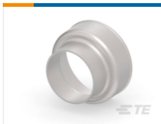
TE Part #5-2344533-1 SHIELD CRIMP FERRULE