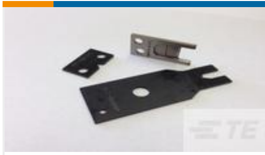
TE Part #1-690474-6 SHEAR BLADE