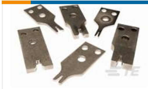
TE Part #2-456411-5 CRIMPER, WIRE .140F PREMIUM