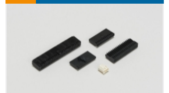
Wire-to-Board Connector Assemblies & Housings(152)