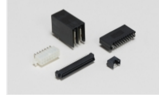
Standard Rectangular Connectors(2)