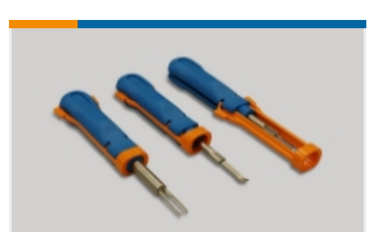
Insertion & Extraction Tools(1)