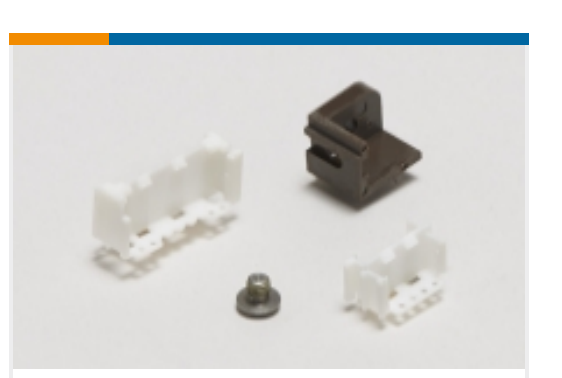
PCB Connector Mounting(8)