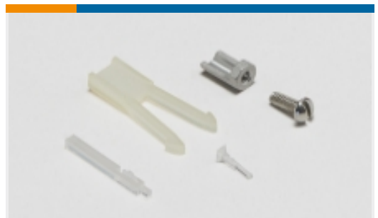
PCB Connector Keying(1)