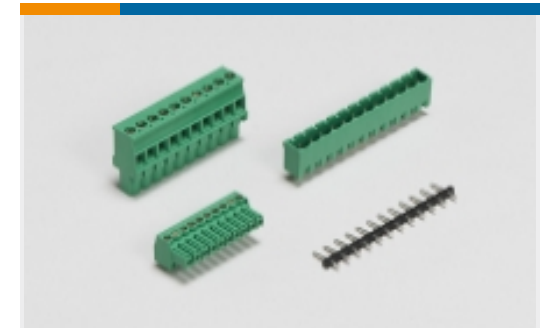
PCB Terminal Blocks(25)