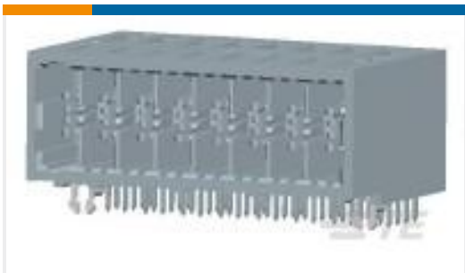
TE Part #1-1747145-5 DZ5200 H-HDR ASSY 5P 5.08MM PITCH