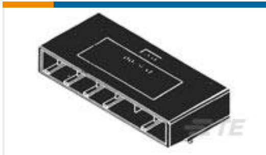
TE Part #2-353082-2 DYNAMIC D-5200 HDR V ASSY 3P