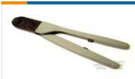
TE Part #91565-1 CCII D-3 S REC TAB 28-24 ASSY