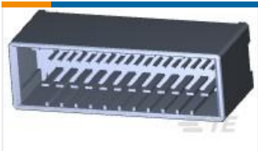
TE Part #1827538-1 DYNAMIC D-2600 HYBRID V-HDR ASSY 48P