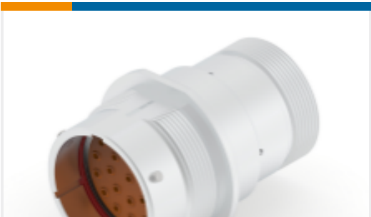
TE Part #HD34-24-23PE-072 REC, 23P, AL, E, THD ADPT DRAIN, 16, P