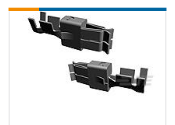
TE Part #964203-1 STD PW TIMER CONTACT