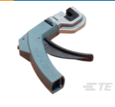
TE Part # 58372-1 HEAD (IDC) 2MM C.T. W/O TL