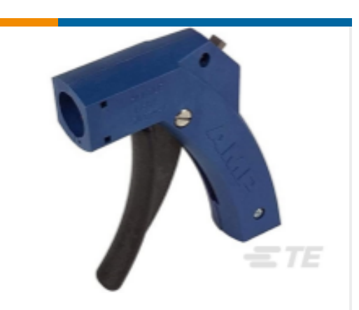
TE Part # 58074-1 MTA 50/100/156 MANUAL TOOL FRAME