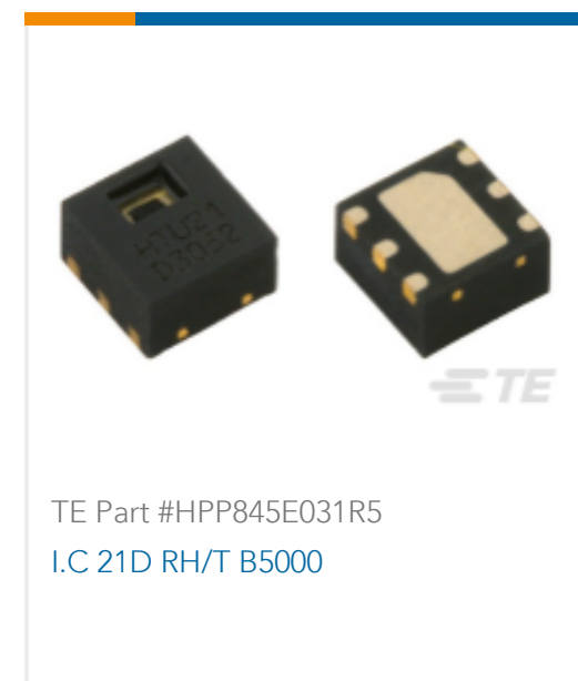
TE Part #HPP845E031R5 I.C 21D RH/T B5000