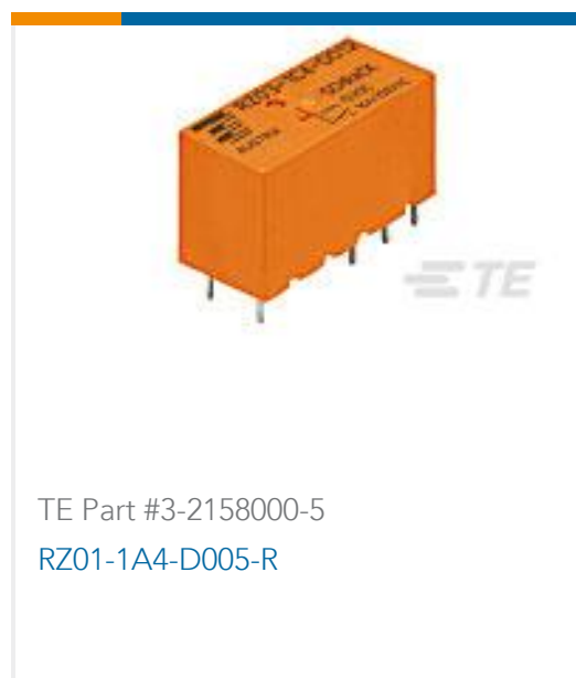
TE Part #3-2158000-5 RZ01-1A4-D005-R