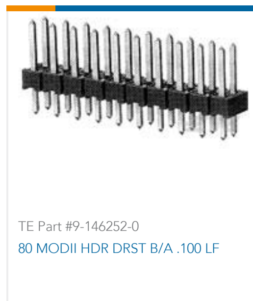
TE Part #9-146252-0 80 MODII HDR DRST B/A .100 LF