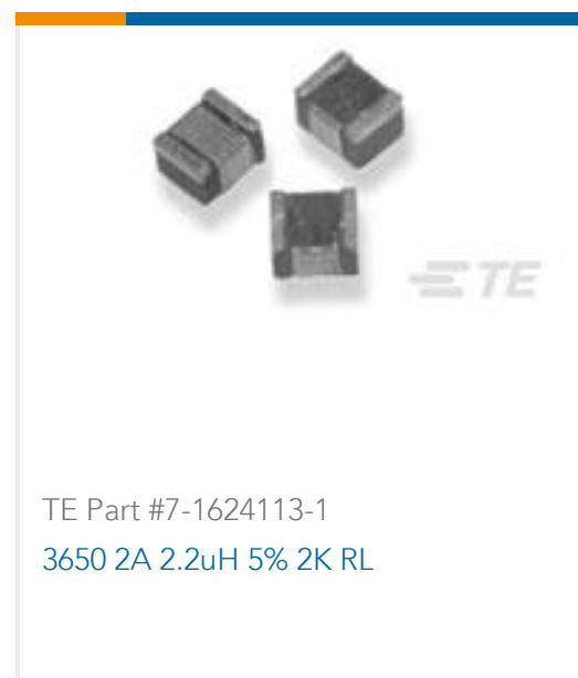
TE Part #7-1624113-1 3650 2A 2.2uH 5% 2K RL