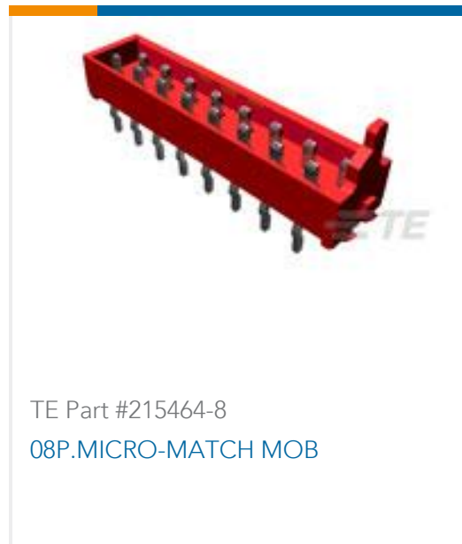
TE Part #215464-8 08P.MICRO-MATCH MOB