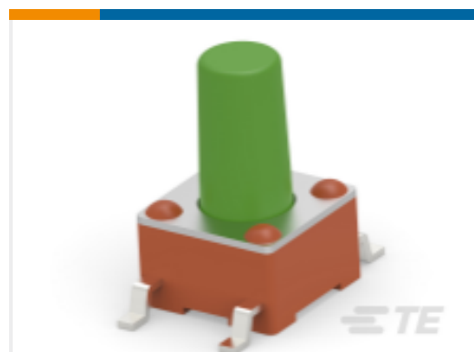
TE Part #2-1977223-4 FSM8JMASTR=6MM TACT SWITCH, SMT 160gf