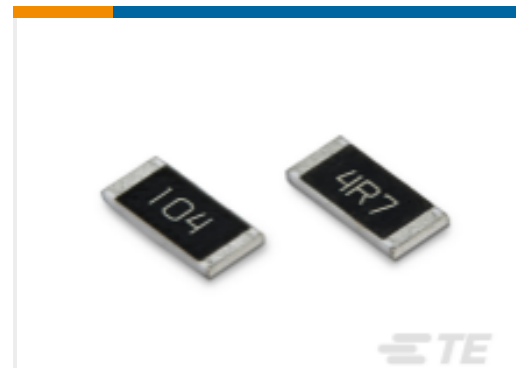
TE Part #6-2176455-4 CPF 0402 499K 0.1% 25ppm 1K RL