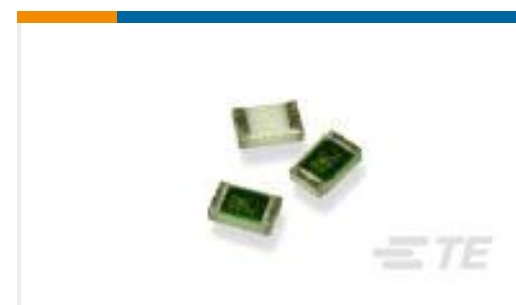
TE Part #1879215-6 CPF 0402 4K53 0.1% 25PPM 1K RL