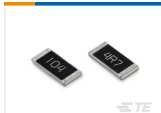
TE Part #4-2176455-7 CPF 0402 332K 0.1% 25ppm 1K RL