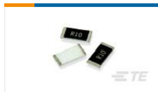
TE Part #3-1879463-2 RL73H 2E R20 1% 1K RL