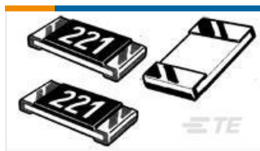
TE Part #1-2176232-1 3522 360K 1% 3W