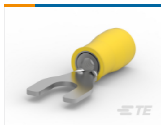
TE Part # 8-32589-2 TERMINAL,PIDG SPD 12-10 10