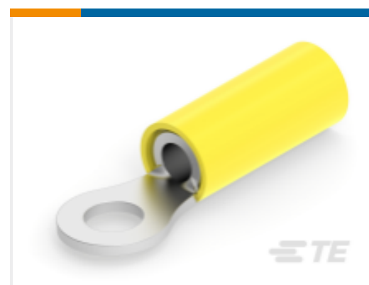
TE Part # 2-36161-3 TERMINAL,PIDG R IR 12 10