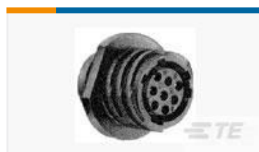
TE Part #206433-2 CPC RECPT ASSEMBLY SIZE 11-8