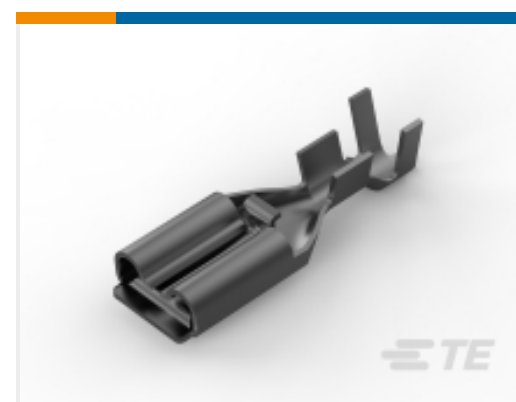
TE Part # 175022-1 250 PL EX REC. 18-14AWG PTBR