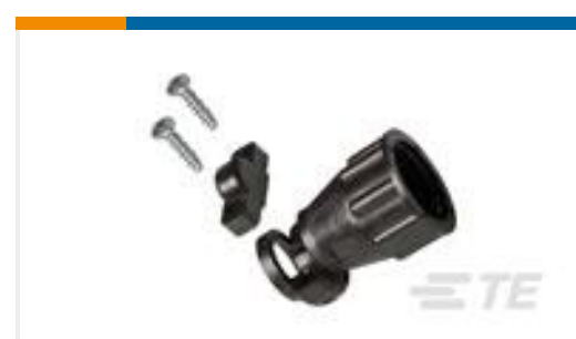
TE Part #1-206062-4 CABLE CLAMP KIT #11