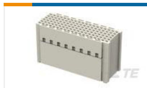
TE Part #1-2102061-1 Mezalok, Socket, 114 p, 18 mm, 30 Au, TL