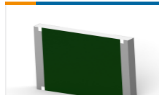
TE Part #2176407-8 3560 27K 1%