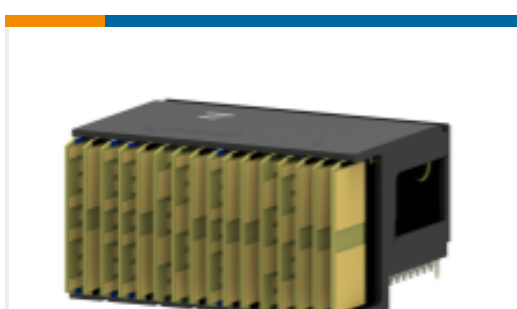
TE Part #2286121-1 MULTIGIG RT2-R, DC, SPACE VPX MODULE 16E