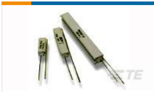
TE Part #3-1623730-6 BCHE 4 W 56R 5%