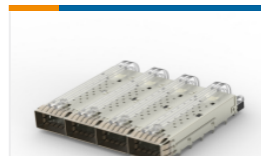
TE Part #2170746-1 CAGE ASSY, 1X4, QSFP28, SPRING, LP