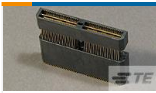
TE Part # 1658020-2 MSB0.80PL30ASY080FL,-,10,-TY