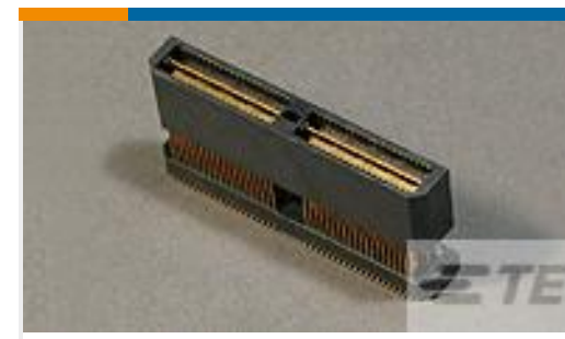
TE Part # 1658048-2 MSB0.80PL19ASY080FL,-,F,-TY