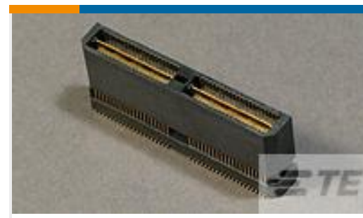
TE Part # 1658047-2 MSB0.80PL16ASY080FL,-,F,-TY