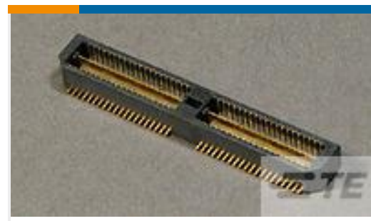
TE Part # 1658044-2 MSB0.80PL5ASY080FL,-,F,-TY