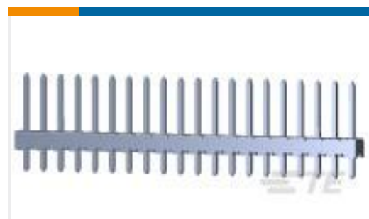
TE Part #5-644456-0 20P MTA100 HDR ASSY (NARROW)