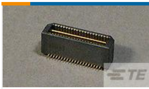
TE Part # 1658045-1 MSB0.80PL8ASY040FL,-,F,-TY