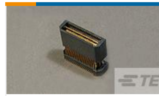
TE Part # 1658048-1 MSB0.80PL19ASY040FL,-,F,-TY