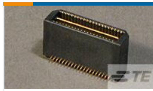
TE Part # 1658046-1 MSB0.80PL11ASY040FL,-,F,-TY