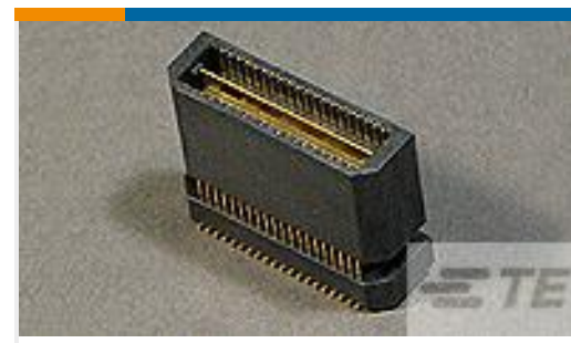
TE Part # 1658047-1 MSB0.80PL16ASY040FL,-,F,-TY