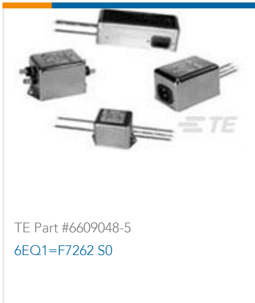
TE Part #6609048-5 6EQ1=F7262 S0