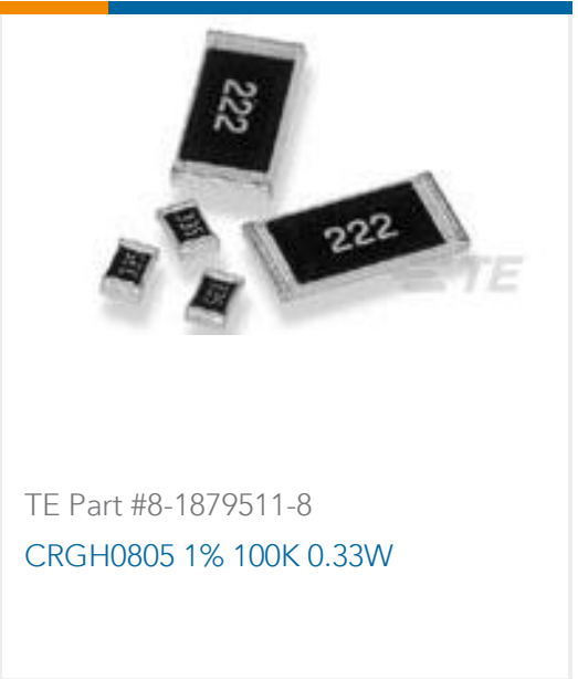
TE Part #8-1879511-8 CRGH0805 1% 100K 0.33W