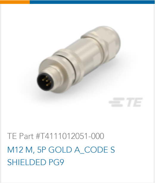
TE Part #T4111012051-000 M12 M, 5P GOLD A_CODE S SHIELDED PG9