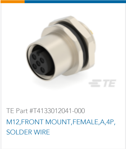
TE Part #T4133012041-000 M12,FRONT MOUNT,FEMALE,A,4P, SOLDER WIRE