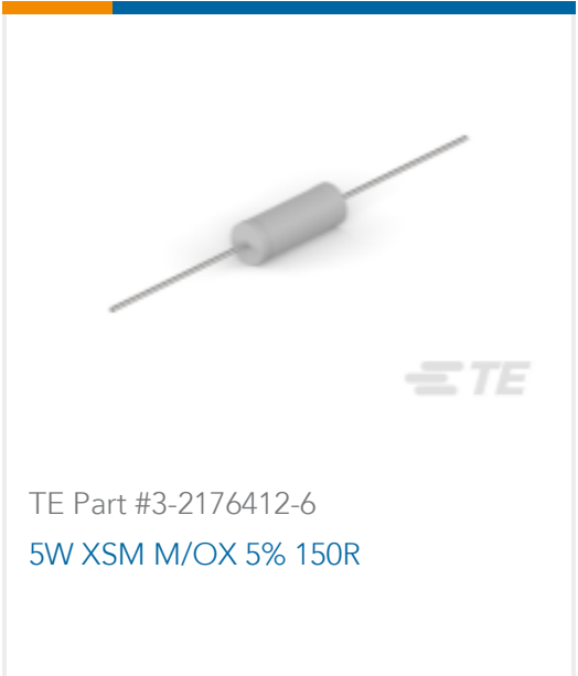
TE Part #3-2176412-6 5W XSM M/OX 5% 150R