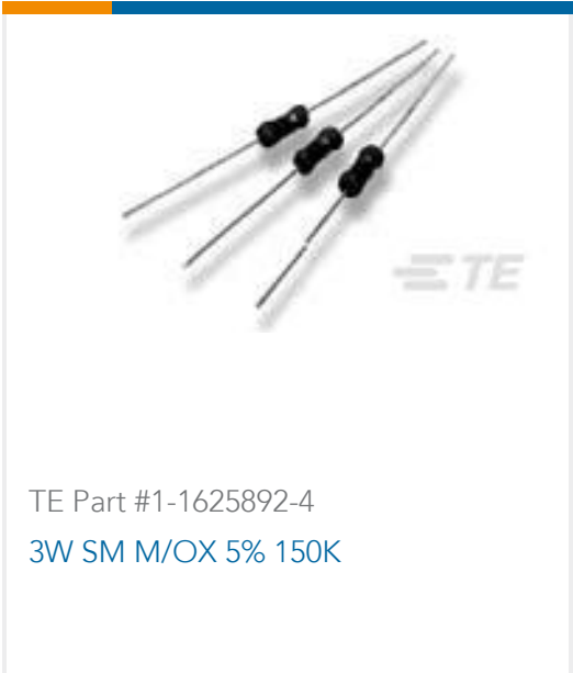
TE Part #1-1625892-4 3W SM M/OX 5% 150K