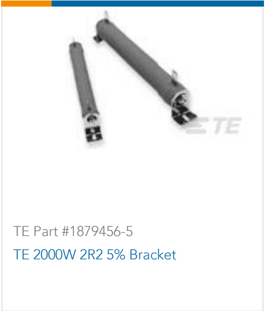
TE Part #1879456-5 TE 2000W 2R2 5% Bracket