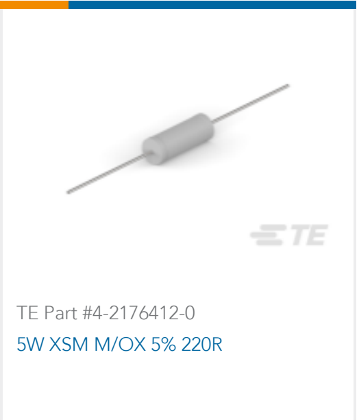
TE Part #4-2176412-0 5W XSM M/OX 5% 220R