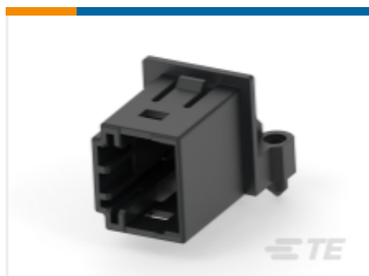
TE Part #953440-5 6W MQS HEADER BENT RIGHT