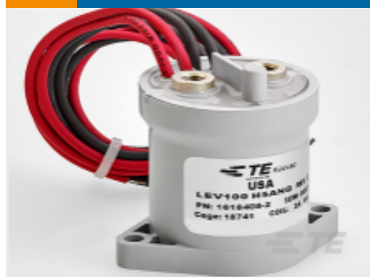
TE Part # 1618408-2 LEV100H5CNG = CONTACTOR WITH AUX SPST