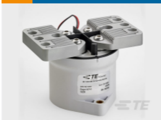
TE Part # 7-1618413-0 K1K06H024EAFA=CONTACTOR SPST-NO W/AUX