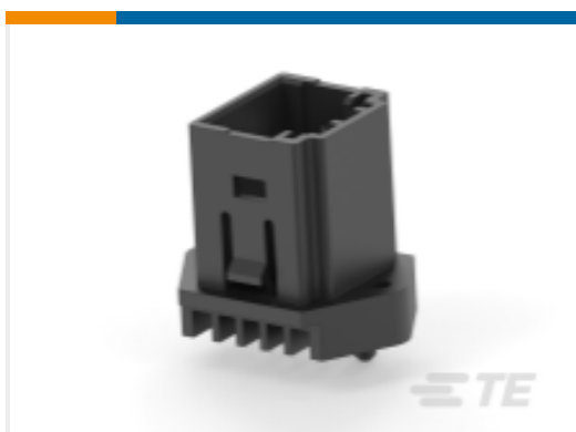
TE Part #953363-5 HEADER ASSY, 6W, STRAIGHT WITH EAR, MQS