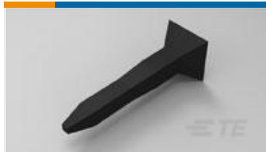
TE Part #499712-1 KEYING PLUG, NOVO RCPT