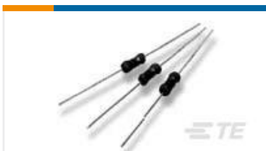
TE Part #6-1625892-1 3W SM M/OX 5% 5K6