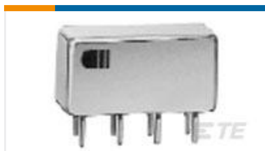
TE Part #2-1617031-0 HFW1201K45 = M39016/6-109L