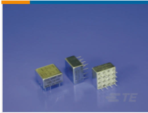
TE Part # CAT-3SBH-4PDT-WCS 4PDT Signal Relay: Electrically-Held, With Coil Suppression