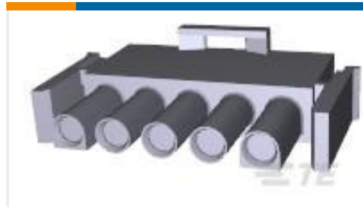
TE Part #350809-1 05P UMNL PLUG HSG