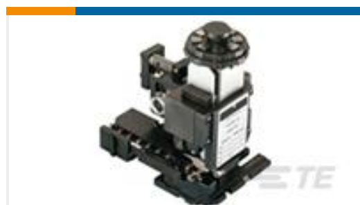
TE Part #567140-2 M SMPR140F190FKSA