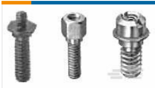
TE Part #749087-1 50SR SCREWLOCK KIT, FEMALE